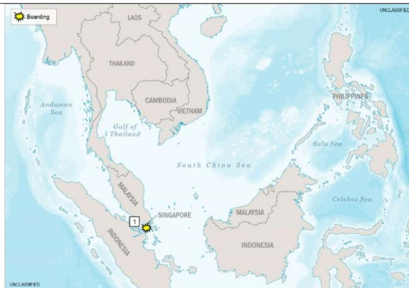
(U) Figure 2. Piracy and Armed Robbery at Sea in Southeast Asia