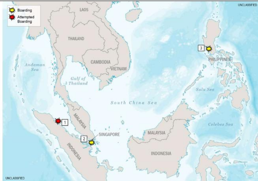
(U) Figure 1. Piracy and Armed Robbery at Sea in Southeast Asia