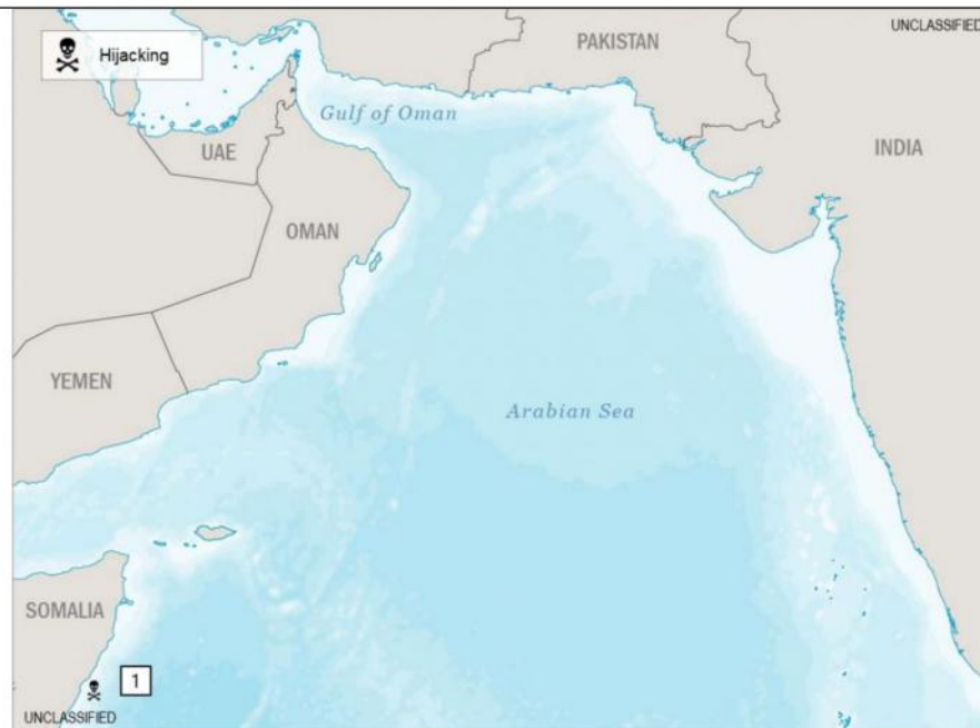
(U) Figure 1. Piracy and Armed Robbery at Sea in the Indian Ocean