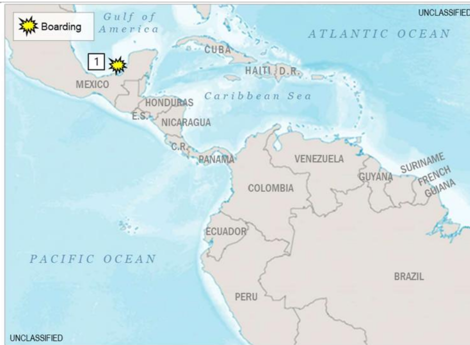
(U) Figure 1. Piracy and Armed Robbery at Sea in the Gulf of America