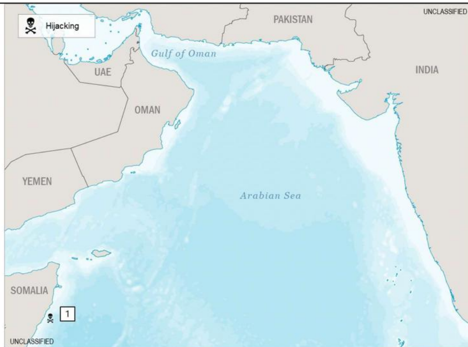
(U) Figure 2. Piracy and Armed Robbery at Sea in the Indian Ocean