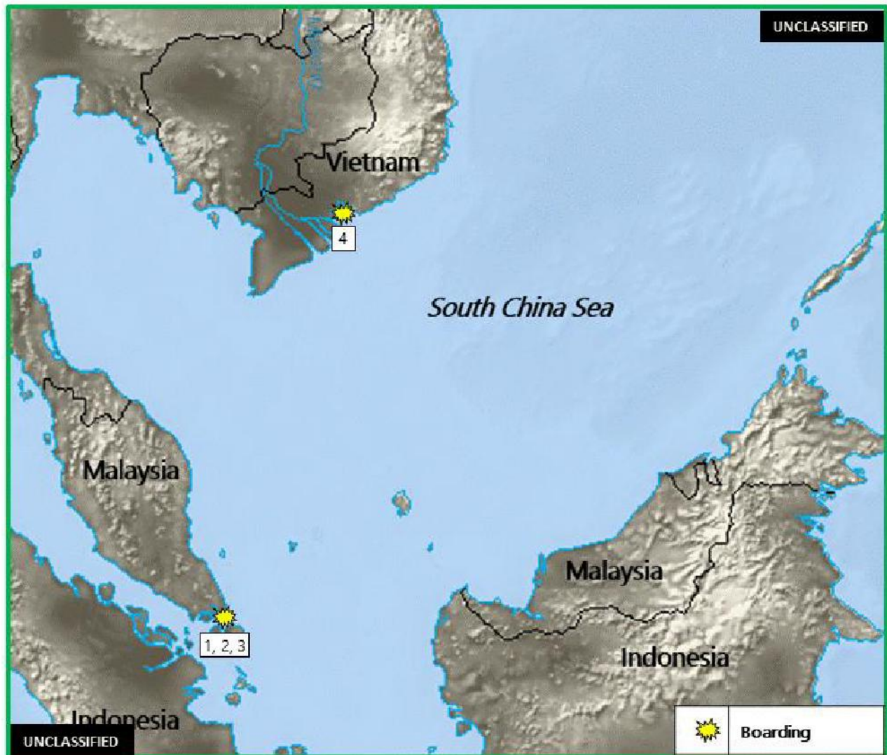
Figure 3. East Asia – Southeast Asia Area Piracy and Maritime Crime

1. (U) INDONESIA: On 9 November, at least one robber boarded the Panama-flagged bulk carrier ATLANTIC DIANA while underway in the Singapore Strait near position 01:67N – 014:18E. The master reported to the Vessel Traffic Information Service that one robber, armed with a knife, was spotted in the engine room. The crew subsequently searched the vessel and confirmed that the robber(s) had departed empty-handed. (ReCAAP; Clearwater Dynamics)