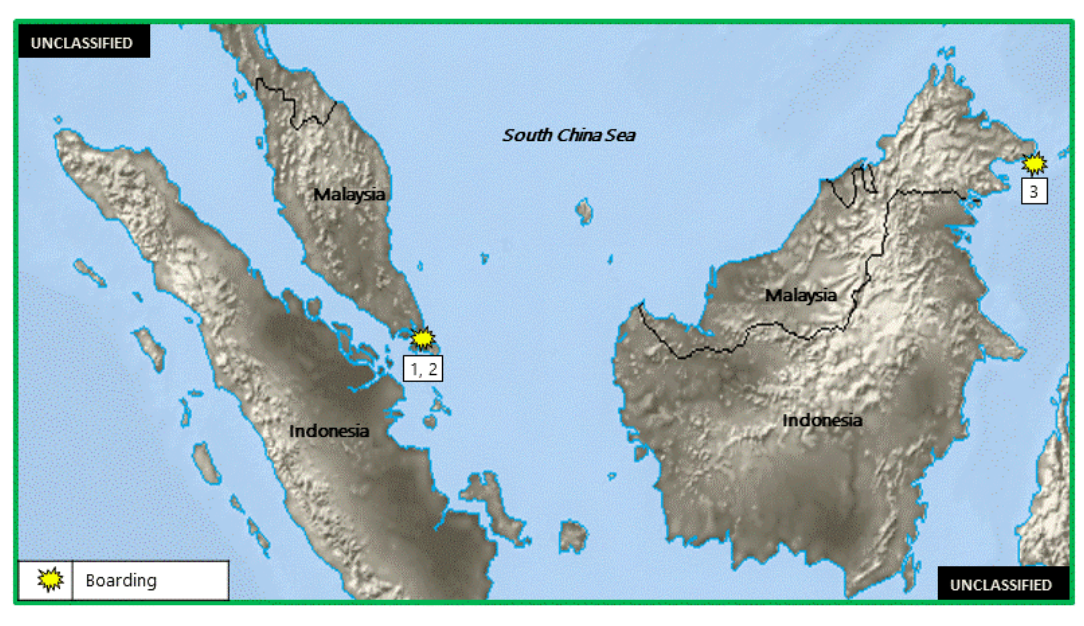
Figure 4. East Asia – Southeast Asia Area Piracy and Maritime Crime