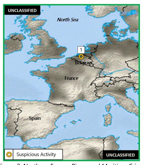
Figure 2. Northern Europe Piracy and Maritime Crime