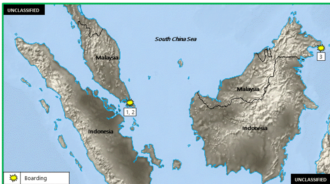
Figure 4. East Asia – Southeast Asia Area Piracy and Maritime Crime

2. (U) GULF OF ADEN: On 29 October, a skiff approached a commercial vessel approximately 33 NM northeast of Point Alpha, International Recommended Transit Corridor near position 12:00N - 045:32E. When the skiff approached to within 0.8 NM of the vessel, the onboard armed security team showed their weapons. The skiff altered course and continued on a parallel course 1 NM from the vessel for 50 minutes before changing course to the south and heading towards Somalia. (Clearwater Dynamics)