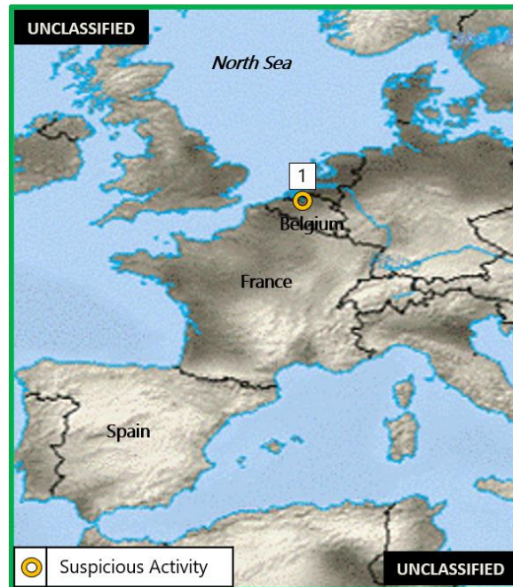
Figure 2. Northern Europe Piracy and Maritime Crime

1. (U) BELGIUM: On 5 November, authorities in the port of Antwerp seized 11.5 tons of cocaine hidden among a cargo of scrap metal that arrived in five shipping containers from South America. ( www.euractiv.com )