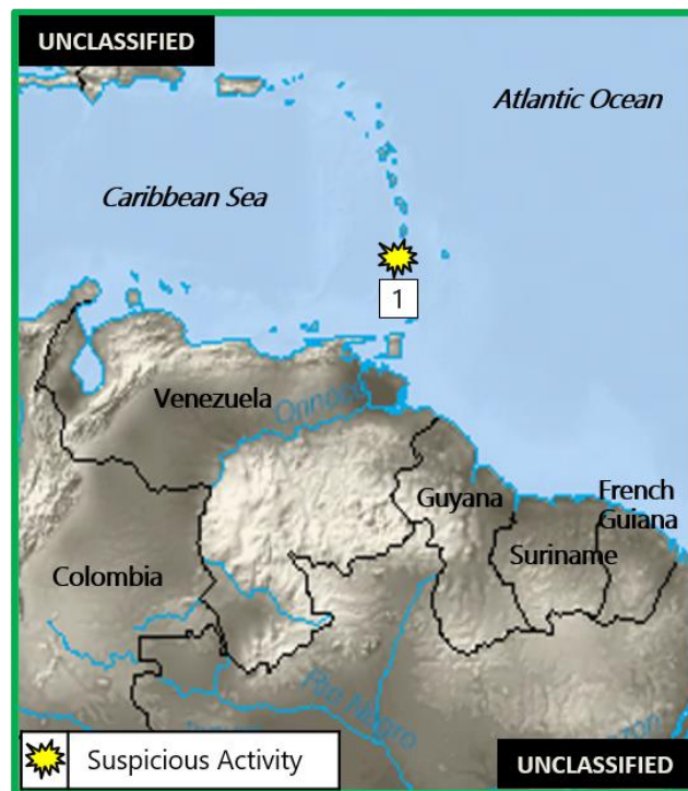
Figure 1. Central America – Caribbean – South America Piracy and Maritime Crime

B. (U) CENTRAL AMERICA - CARIBBEAN - SOUTH AMERICA: