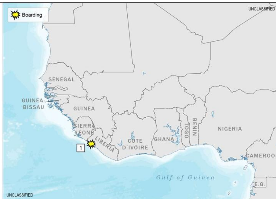
(U) Figure 1. Piracy and Armed Robbery at Sea in West Africa