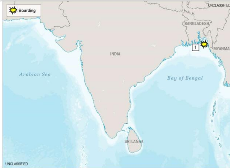
(U) Figure 3. Piracy and Armed Robbery at Sea in Indian Subcontinent