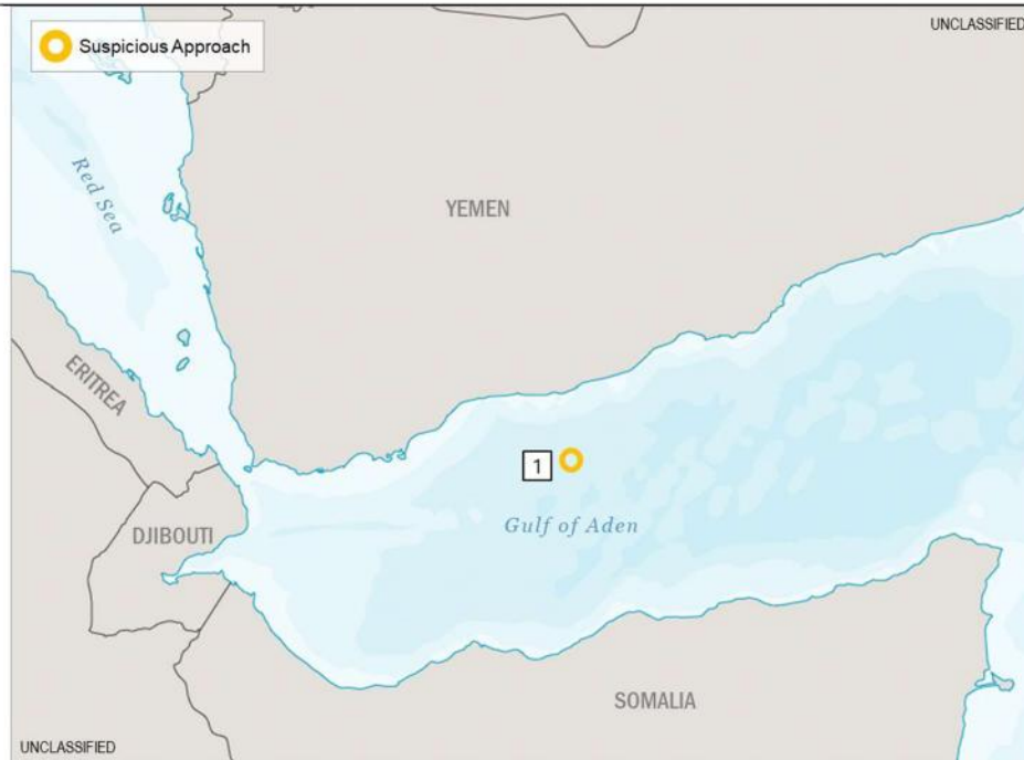
(U) Figure 2. Suspicious Approach in the Gulf of Aden