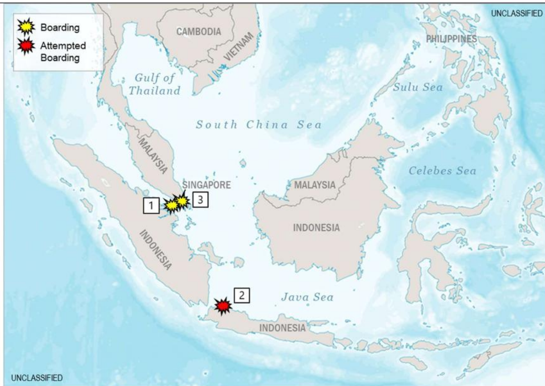
(U) Figure 2. Piracy and Armed Robbery at Sea in Southeast Asia