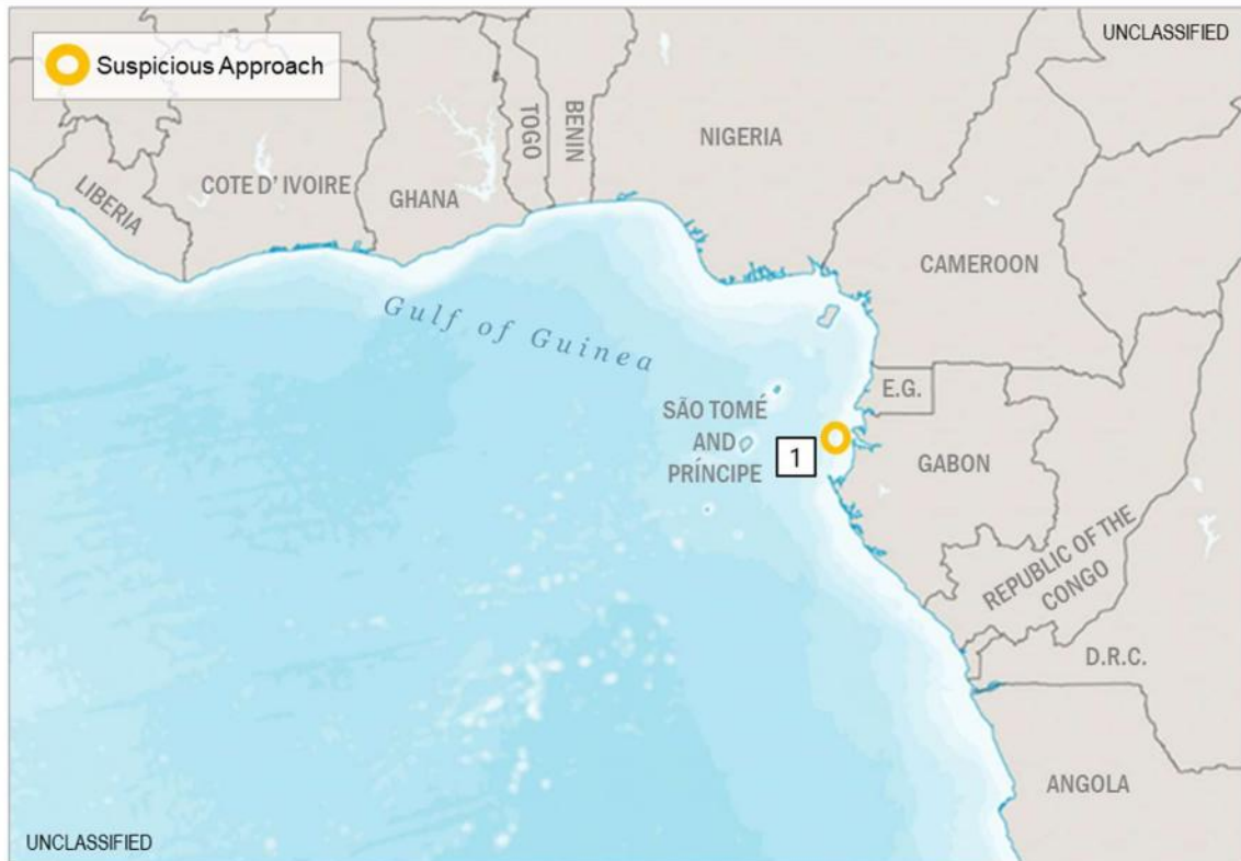
(U) Figure 1. Suspicious Approach in Gulf of Guinea