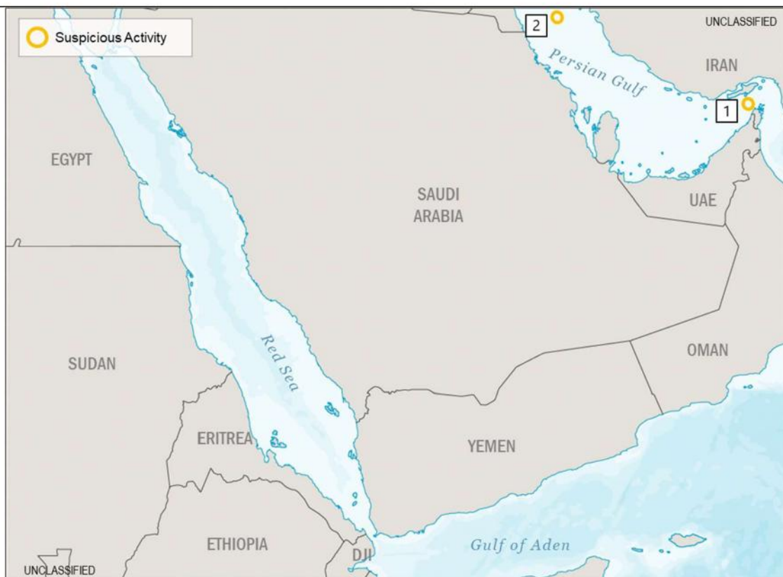
(U) Figure 1. Suspicious Activity in Persian Gulf