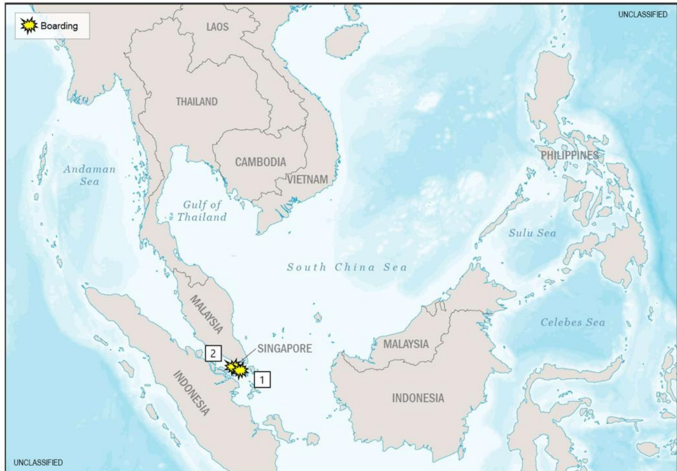
(U) Figure 1. Piracy and Armed Robbery at Sea in Southeast Asia