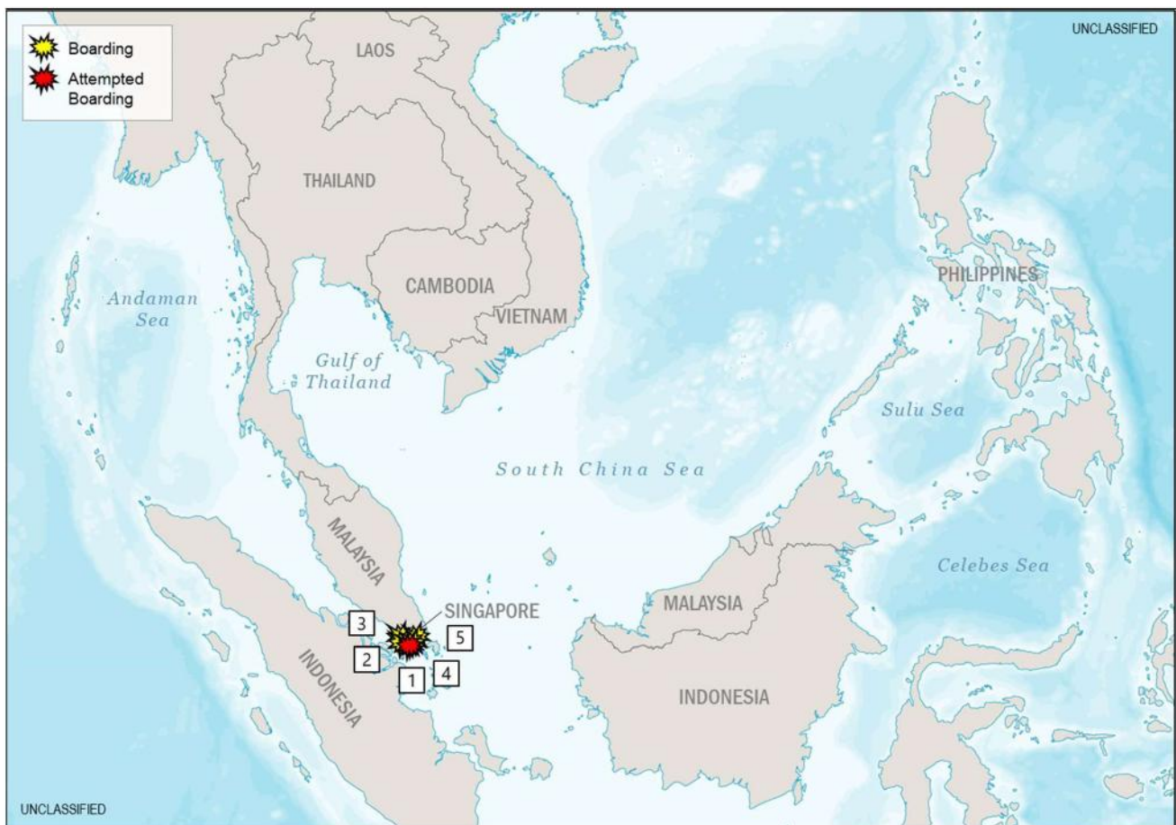
(U) Figure 1. Piracy and Armed Robbery at Sea in Southeast Asia