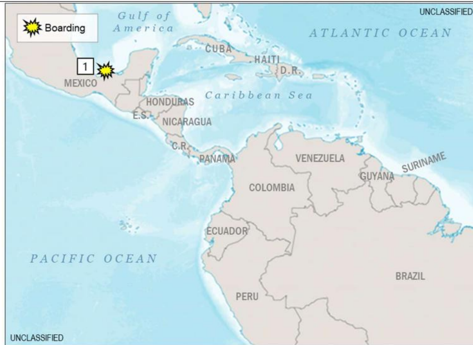
(U) Figure 1. Piracy and Armed Robbery at Sea in the Gulf of America