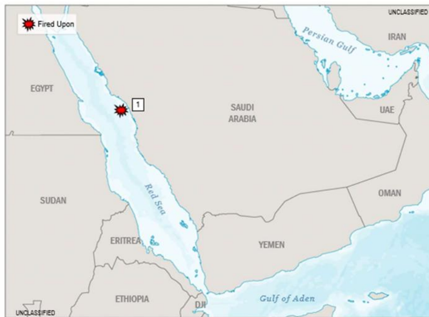
(U) Figure 1. Merchant Vessel Attacked in the Red Sea