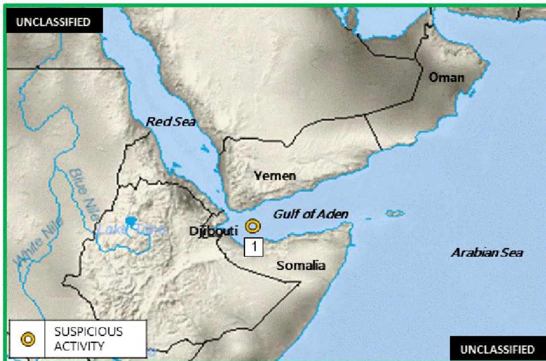
Figure 3. Indian Ocean – East Africa – Red Sea Piracy and Maritime Crime

1. (U) GULF OF ADEN: On 14 January, a bulk carrier was approached by a skiff approximately 58 NM southwest of Aden, Yemen, near position 12:06N – 044:25E. During the incident, the crew sounded the alarm and mustered. At