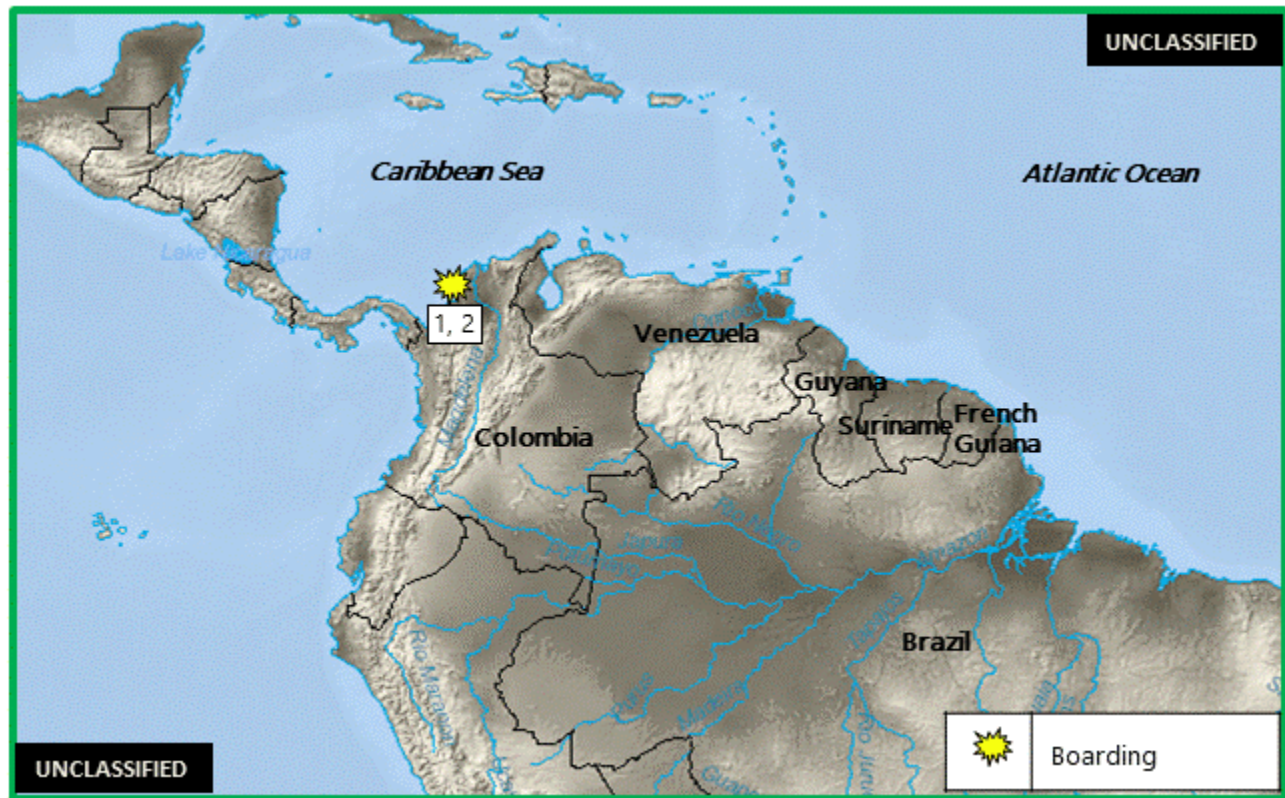
Figure 1. Central America – Caribbean – South America Piracy and Maritime Crime

B. (U) CENTRAL AMERICA – CARIBBEAN – SOUTH AMERICA: