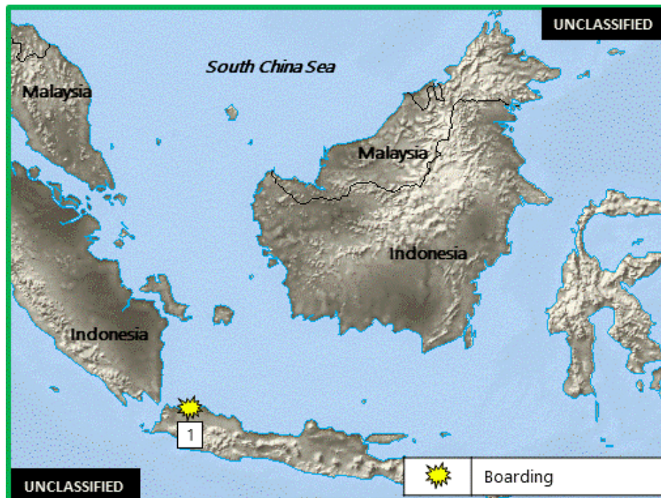
Figure 3. East Asia – Southeast Asia Piracy and Maritime Crime