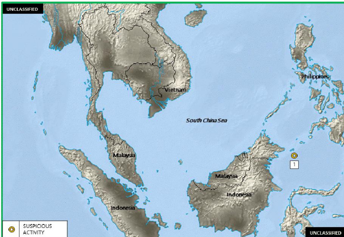
Figure 4. East Asia – Southeast Asia Piracy and Maritime Crime

1. (U) PHILIPPINES: On 3 March, a bulk carrier reported a suspicious approach by a skiff carrying three persons 11 NM southeast of Sibutu Island, Tawi Tawi. (Clearwater Dynamics)