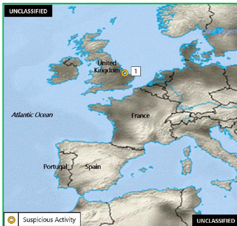
Figure 1. Northern Europe – Baltic Sea Piracy and Maritime Crime

1. (U) ENGLAND: On 16 February, a stowaway from Morocco was discovered onboard a ship in the Port of Hull. ( www.hulldailymail.co.uk )