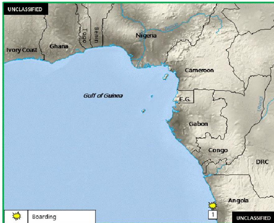
Figure 2. West Africa Piracy and Maritime Crime

1. (U) ANGOLA: On 26 February, robbers boarded an offshore supply ship anchored in Luanda Anchorage, near position 08:45S - 013:17E. The robbers were able to board the ship, steal ship's property, and escape unnoticed. The theft was noticed by a duty crewman during routine rounds. The crew conducted a search of the ship and confirmed the robbers had escaped. Incident reported to local port authorities. (IMB, Clearwater Dynamics)