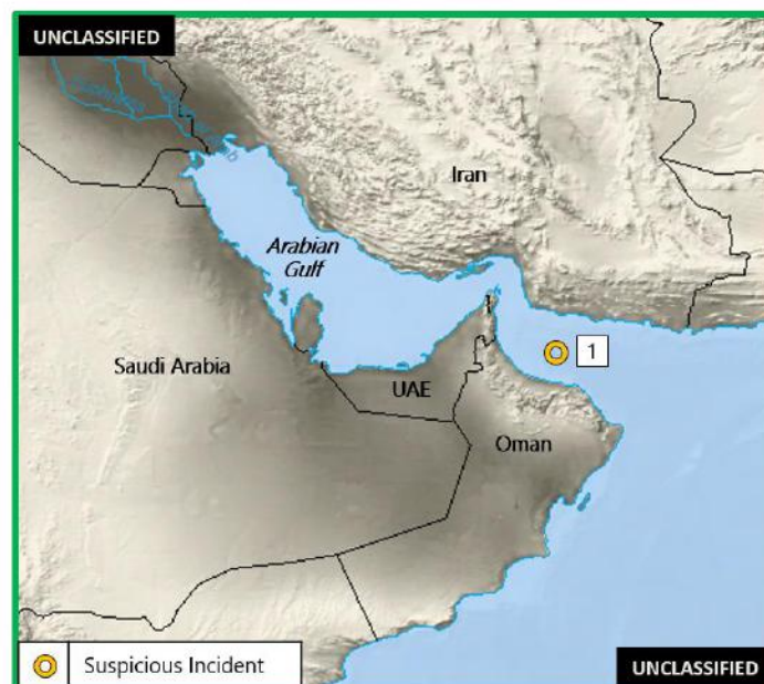
Figure 3. Indian Ocean – East Africa – Red Sea Piracy and Maritime Crime