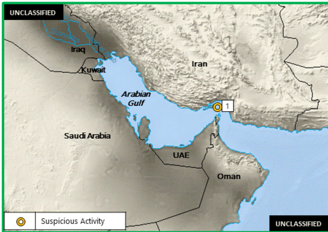
Figure 2. Arabian Gulf Piracy and Maritime Crime

1. (U) UNITED ARAB EMIRATES: On 22 March, a vessel transiting the Strait of Hormuz reported a suspicious approach by one small grey boat with 3 persons onboard wearing masks. The approach occurred approximately 21 NM north of Mina Saqr near position 26:20N – 056:01E. (Dryad Global)