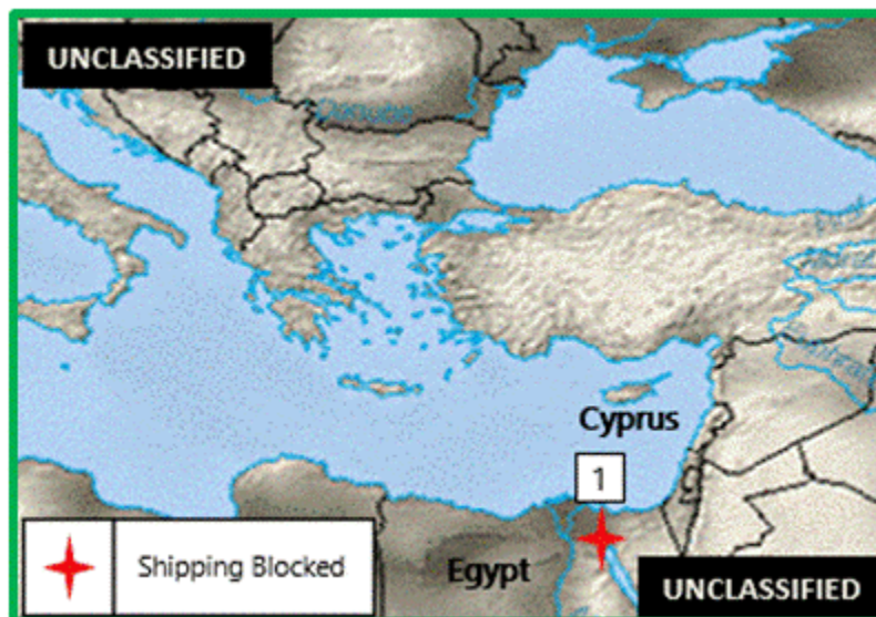
Figure 3. Indian Ocean – East Africa – Red Sea Piracy and Maritime Crime

1. (U) UNITED ARAB EMIRATES: On 22 March, a vessel transiting the Strait of Hormuz reported a suspicious approach by one small grey boat with 3 persons onboard wearing masks. The approach occurred approximately 21 NM north of Mina Saqr near position 26:20N – 056:01E. (Dryad Global)