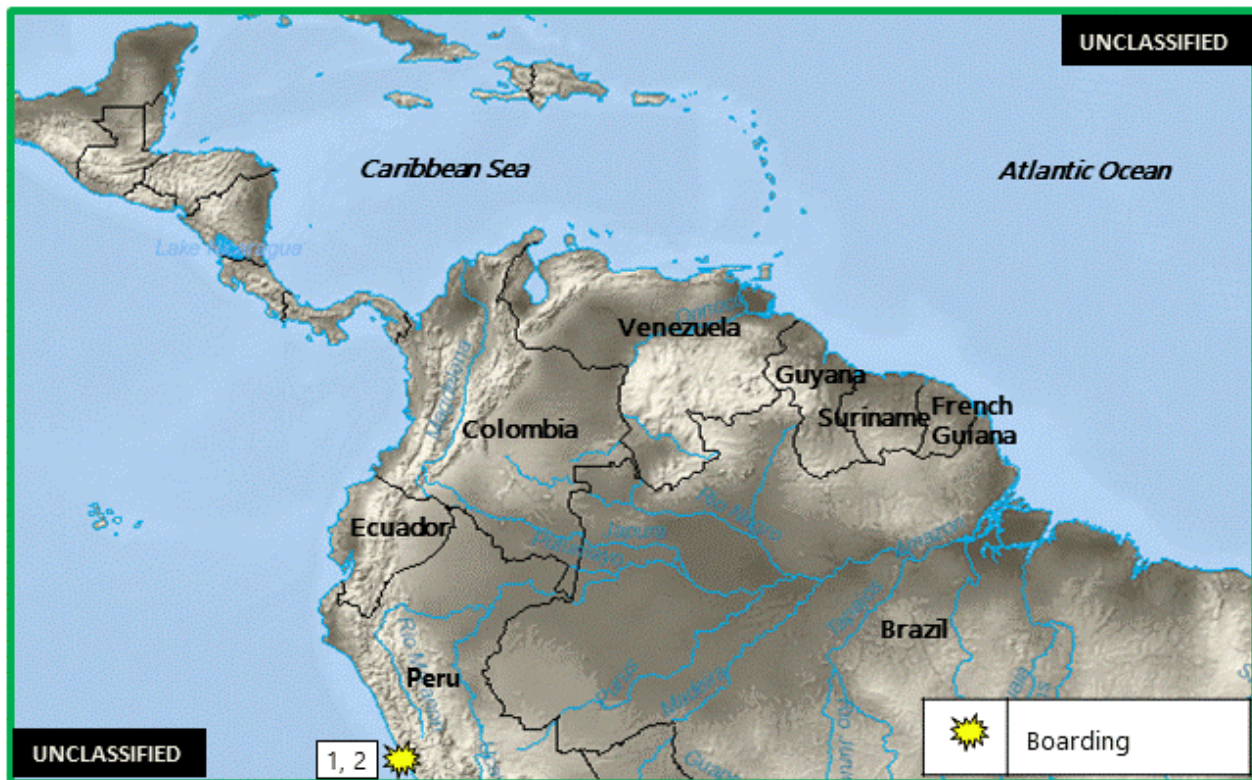
Figure 1. Central America – Caribbean – South America Piracy and Maritime Crime

1. (U) PERU: On 16 March, robbers boarded an anchored bulk carrier at Callao Anchorage, near position 12:01S – 077:10W. The robbers managed to board the vessel, break into the forecastle store room and steal ship's properties without being spotted. The duty crew noticed the robbery had taken place while on routine rounds. (IMB; Clearwater Dynamics)