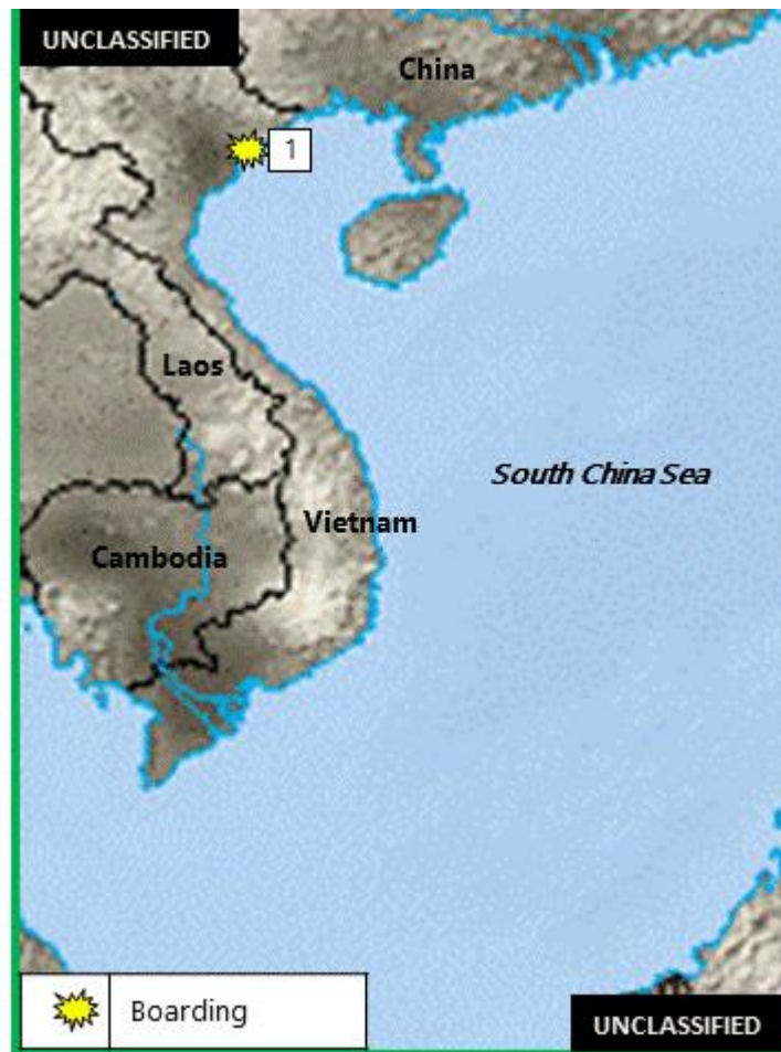
Figure 4. East Asia – Southeast Asia Piracy and Maritime Crime

1. (U) VIETNAM: On 15 March, robbers boarded a moored bulk carrier at Campha Port, near position 20:54N – 107:16E. The robbers broke into two crew cabins, stealing cash before making their escape. The local authorities were informed and an investigation was carried out. (IMB; Clearwater Dynamics)