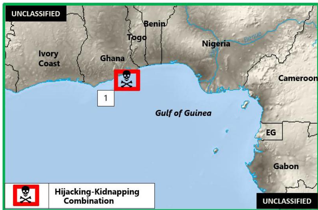
Figure 1. West Africa Piracy and maritime Crime

1. (U) GHANA: On 19 May, eight armed perpetrators in a skiff initially approached and fired upon a Ghana-flagged fishing trawler at 18:30 local time in position 04:33N – 000:15E, approximately 66 NM south of Tema. The trawler stopped, and five armed pirates boarded and remained onboard for about six hours. The pirates kidnapped five crew members (four Chinese nationals and one Russian), and removed personal crew belongings and other valuables. No injuries were reported to the remaining crew. The trawler's crew identified the pirates as Nigerian. After the kidnapping, the trawler headed back towards Tema port. (Clearwater Dynamics)