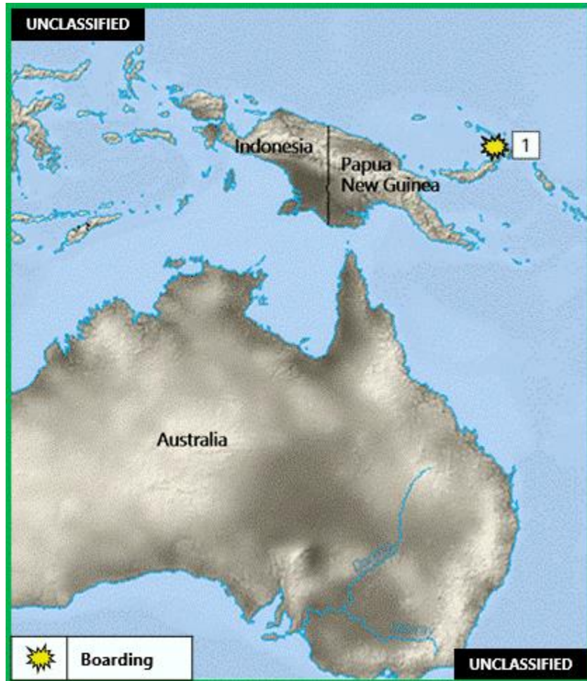
Figure 3. Australia – New Zealand – Pacific Ocean Area Piracy and Maritime Crime

1. (U) INDIA: On 13 July, robbers managed to board a Singapore-flagged bulk carrier NORD PENGUIN unnoticed while berthed at Haldia port near position 22:02N – 088:05E. The duty crew in the engine noticed the padlock of the entrance door to the engine room broken and spares missing. Alarm was raised, the crew were mustered, and a search was carried out. The incident was reported to the local agent. (Clearwater Dynamics; IMO-GISIS)