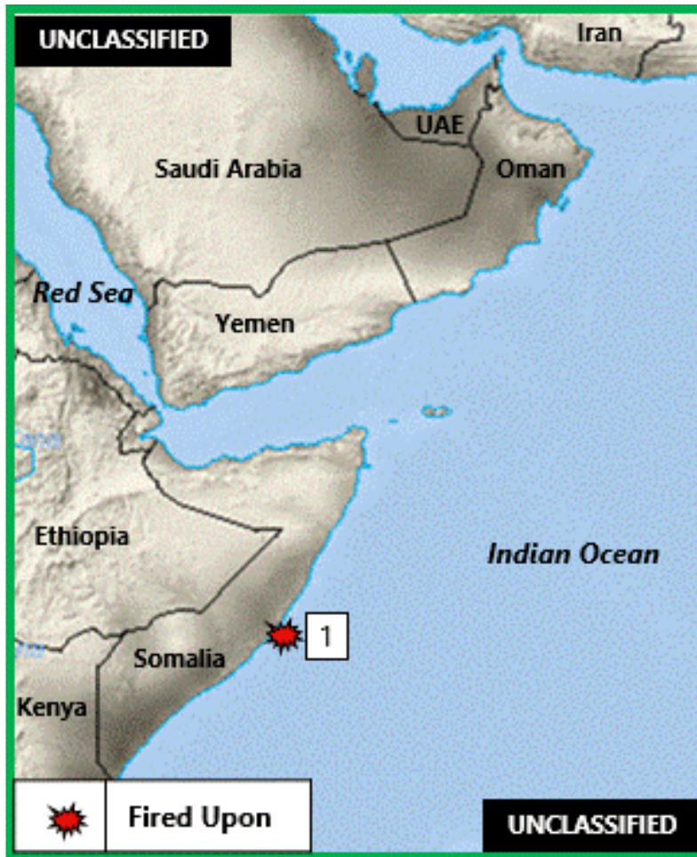
Figure 2. Indian Ocean – East Africa – Red Sea Piracy and Maritime Crime

H. (U) INDIAN OCEAN – EAST AFRICA – RED SEA: