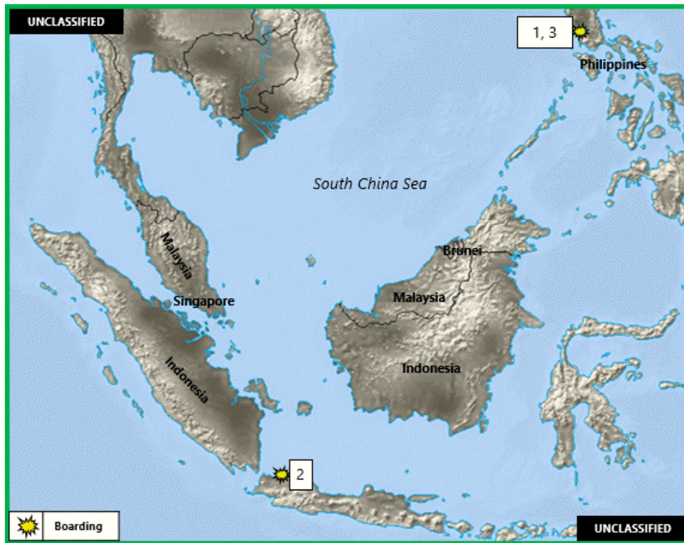
Figure 3. East Asia – Southeast Asia Piracy and Maritime Crime

1. (U) PHILIPPINES: On 13 August at 01:30 local time, five robbers boarded a container vessel anchored in Manila Quarantine Anchorage, near position 14:35N – 125:50E. They tied up one crew member before stealing ship's properties and then making their escape. The incident was reported to port authorities and the Philippine Coast Guard. (Clearwater Dynamics)