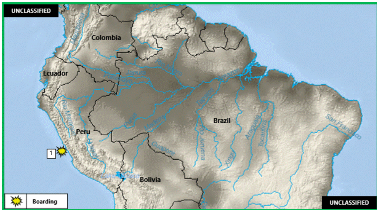
Figure 1. Central America – Caribbean – South America Piracy and Maritime Crime

B. (U) CENTRAL AMERICA – CARIBBEAN – SOUTH AMERICA: