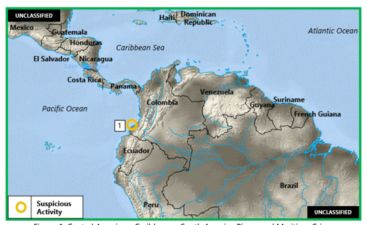
Figure 1. Central America – Caribbean – South America Piracy and Maritime Crime

1. (U) COLOMBIA: On 1 September, the Colombian Navy announced the seizure of 1.8 tons of cocaine and a semisubmersible craft used to smuggle the drugs. The seizure operation was carried out in an estuary in northern Nariño Department. (www.gcaptain.com)