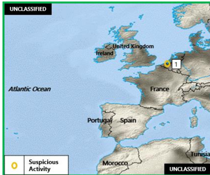
Figure 1. Northern Europe – Baltic Piracy and Maritime Crime

1. (U) FRANCE: On 11 October, at approximately 0100 hours local time, ten armed intruders boarded the Liberia-flagged bulk carrier TRUDY while it was in the port of Dunkirk for a drug inspection, and took the crew captive. The leaders of this unauthorized boarding party spoke English and were “violent and threatening” in their manner, according to local police. They searched the vessel, “accompanied by the captain,” but did not appear to take anything. They departed empty-handed at about 0500 hours. No serious injuries were reported. ( www.maritime-executive.com )