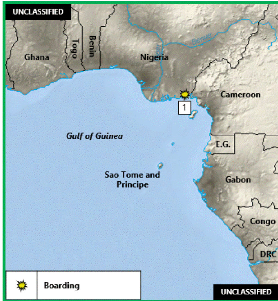
Figure 2. West Africa Piracy and Maritime Crime

1. (U) NIGERIA: On 5 October, armed men boarded two fishing vessels offshore of Ibaka in the Mbo Local Government Area of Akwa Ibom State. The robbers stole outboard motors from both fishing boats. A spokesman representing the fishermen said that 25 fishermen aboard the boats were stranded at sea because people were afraid to mount a rescue operation for fear of being attacked. ( www.punchng.com ; www.thisdaylive.com )