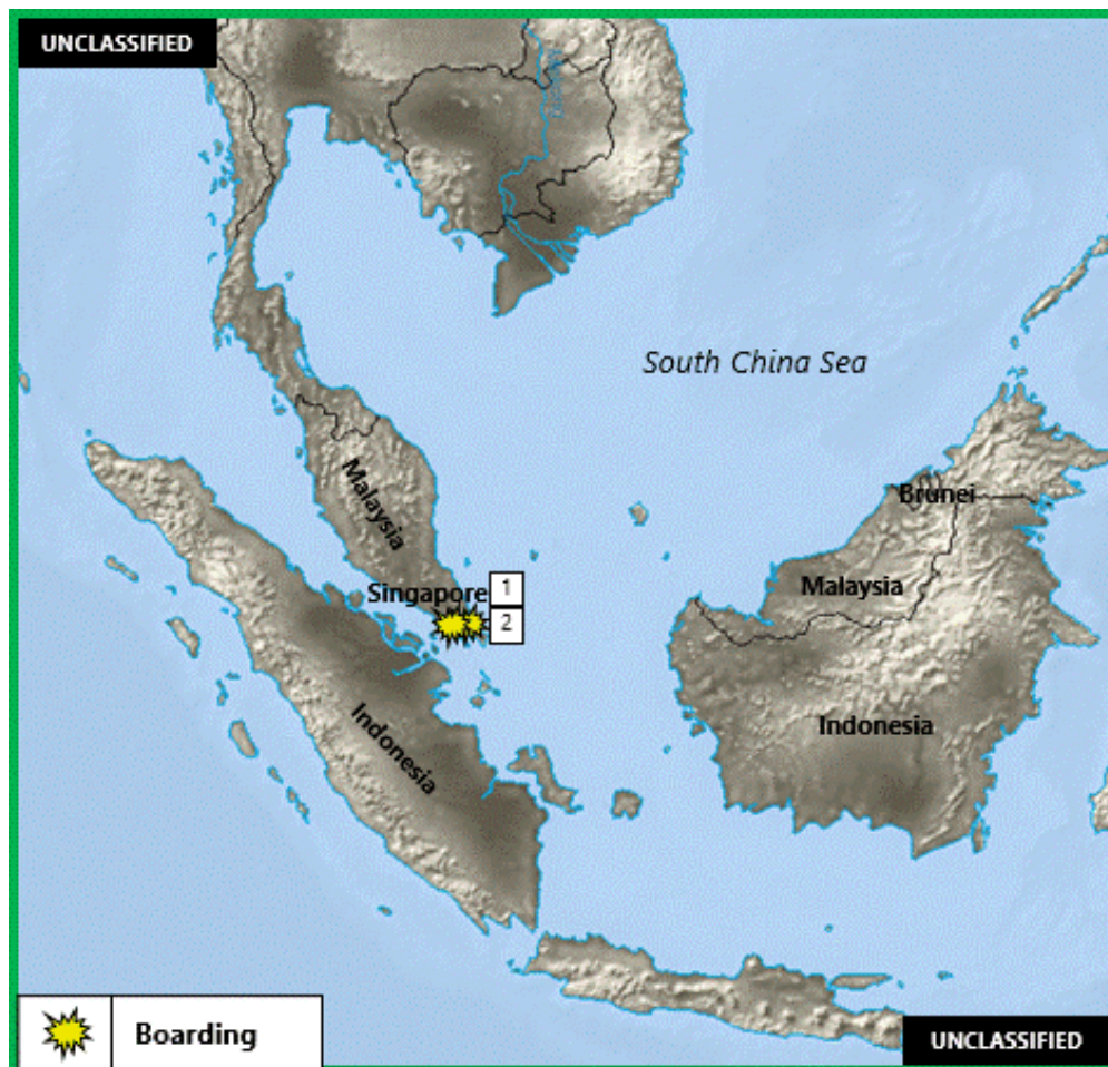
Figure 4. East Asia – Southeast Asia Sea Piracy and Maritime Crime

1. (U) SINGAPORE STRAIT: On 10 October, two robbers boarded a bulk carrier underway in the eastbound lane of the Singapore Strait Traffic Separation Scheme, near position 01:15N - 104:11E. After the robbers were seen in the engine room, the chief engineer was informed, and he then notified the bridge. The robbers escaped after the alarm was raised and the crew mustered. A search of the ship was carried out and nothing was reported missing. (IMB; Clearwater Dynamics)