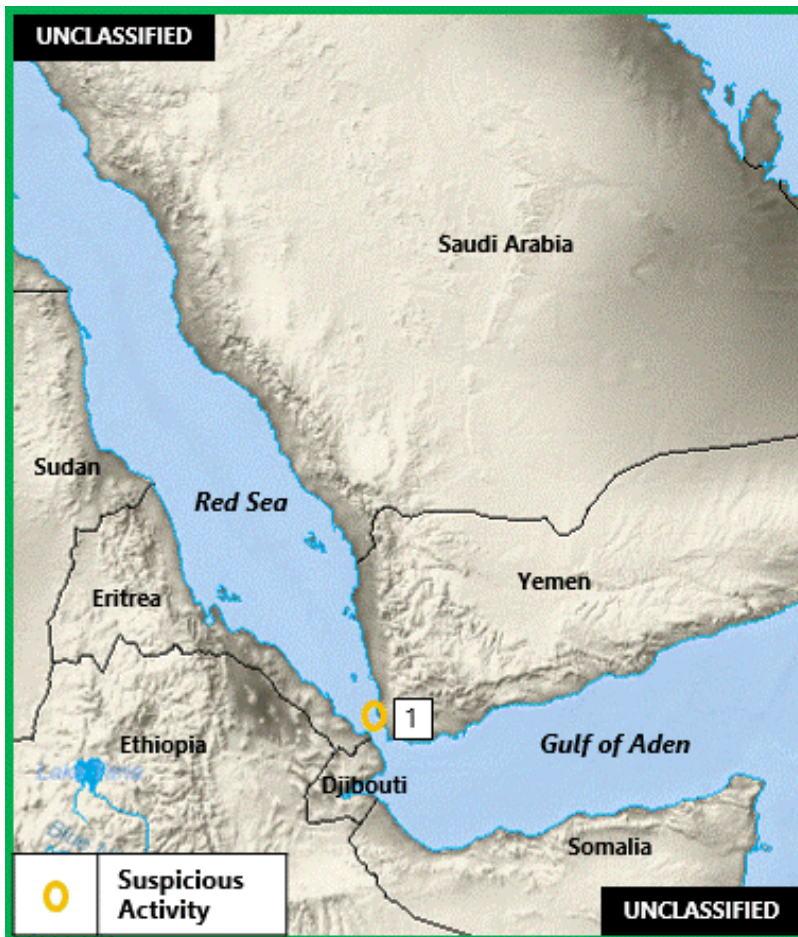
Figure 4. Indian Ocean – East Africa – Red Sea Piracy and Maritime Crime

1. (U) RED SEA: On 19 October, a vessel reported being approached while underway approximately 13 NM west of Gurayrah, Yemen, near position 12:43N – 043:16E. Six persons onboard one small craft approached to within 50 meters of the vessel. Ladders were also sighted in the small craft. The armed security team onboard the vessel displayed their weapons, which resulted in the suspicious craft aborting its approach. The vessel and crew are reported as safe. (UKMTO; IMB; MSCHOA; Clearwater Dynamics)