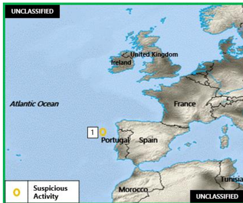
Figure 2. Northern Europe – Baltic Piracy and Maritime Crime

1. (U) NORTH ATLANTIC OCEAN: On 16 October, Spain's National Police and Portugal's Judicial Police seized 5.2 tons of cocaine from a sailboat about 300 NM off the coast of Portugal. Working in cooperation with the Portuguese Navy and Air Force, along with the organized crime unit of Spain's National Police Corps, the Portuguese authorities intercepted a 78-foot Spanish-flagged sailboat. A boarding team arrested three suspects, all foreign nationals, including one individual who is well-known to the authorities for small-craft trafficking operations. ( www.maritime-exective.com )