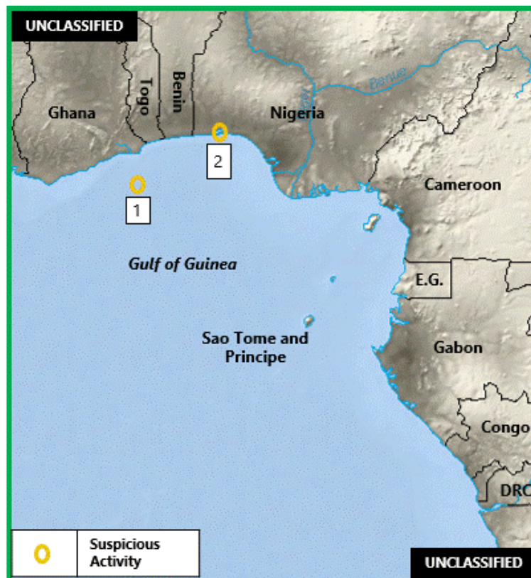
Figure 3. West Africa Piracy and Maritime Crime

E. (U) MEDITERRANEAN – BLACK SEA: No current incidents to report.