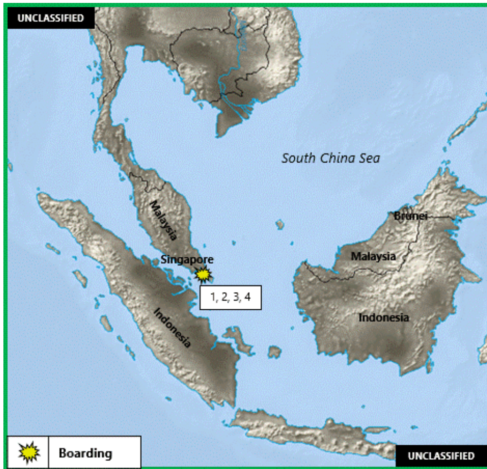
Figure 5. East Asia – Southeast Asia Sea Piracy and Maritime Crime

1. (U) MALAYSIA: On 20 Oct, robbers boarded the Panama-flagged cargo ship SUPER STAR while underway at 0200 local time in the eastbound lane of the Singapore Strait Traffic Separation Scheme (TSS), near position 01:16N – 104:16E. Five robbers, two of them armed with guns, boarded the vessel but were unsuccessful in their attempts to steal ship's properties. The robbers escaped empty handed. All crew were accounted for, and the vessel continued its voyage. (ReCAAP; Clearwater Dynamics)