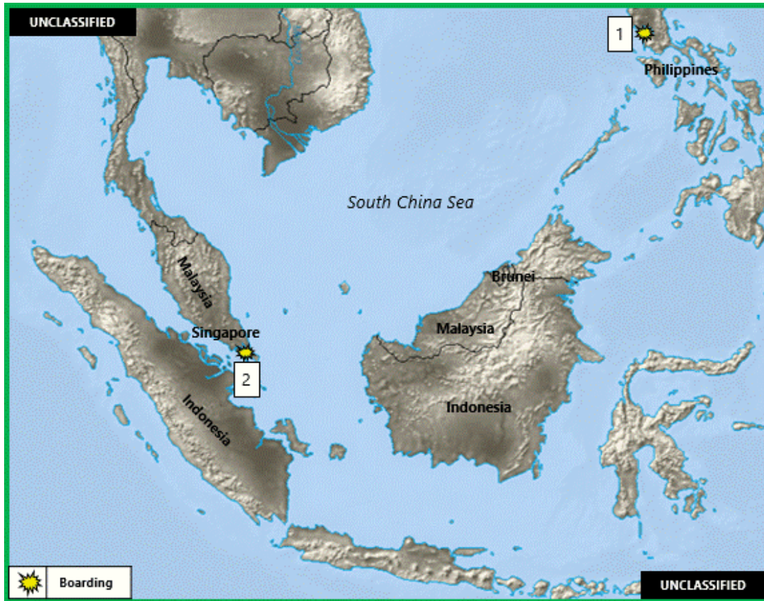
Figure 3. East Asia – Southeast Asia Piracy and Maritime Crime

1. (U) PHILIPPINES: On 17 November, robbers boarded a utility vessel anchored in Batangas Bay, near position 13:44N – 144:02E. During routine rounds, a duty crewman noticed that the padlock to the boson store room had been broken. Upon searching the store room, three grinders, two firefighting nozzles, one electric extension cord, and one shackle were noted missing. All crew were reported as safe. (Clearwater Dynamics)