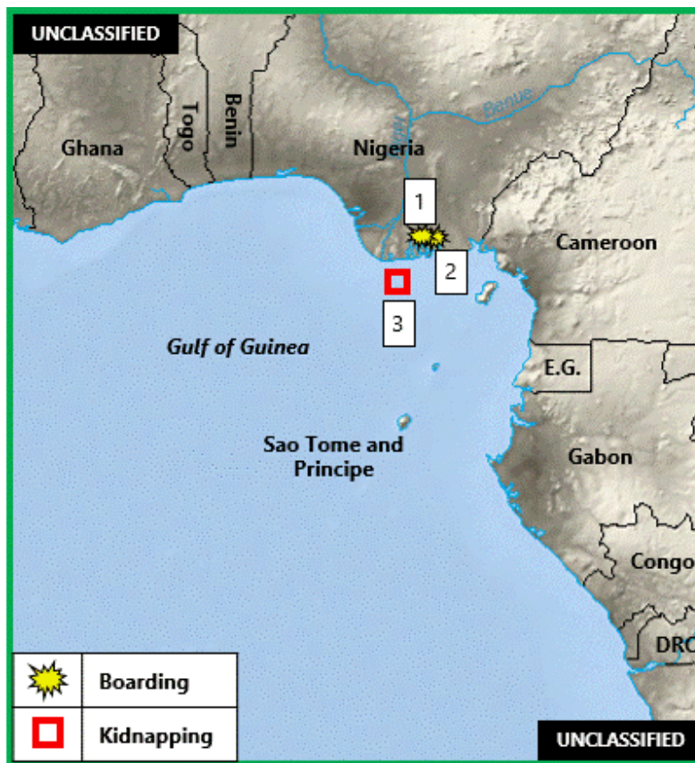
Figure 2. West Africa Piracy and Maritime Crime

1. (U) SPAIN: On 26 October, activists from an international environmental organization blocked the port of Valencia to protest the arrival of the Marshall Islands-flagged LNG tanker MERCHANT, carrying a cargo of natural gas from the United States. ( www.martime-executive.com )