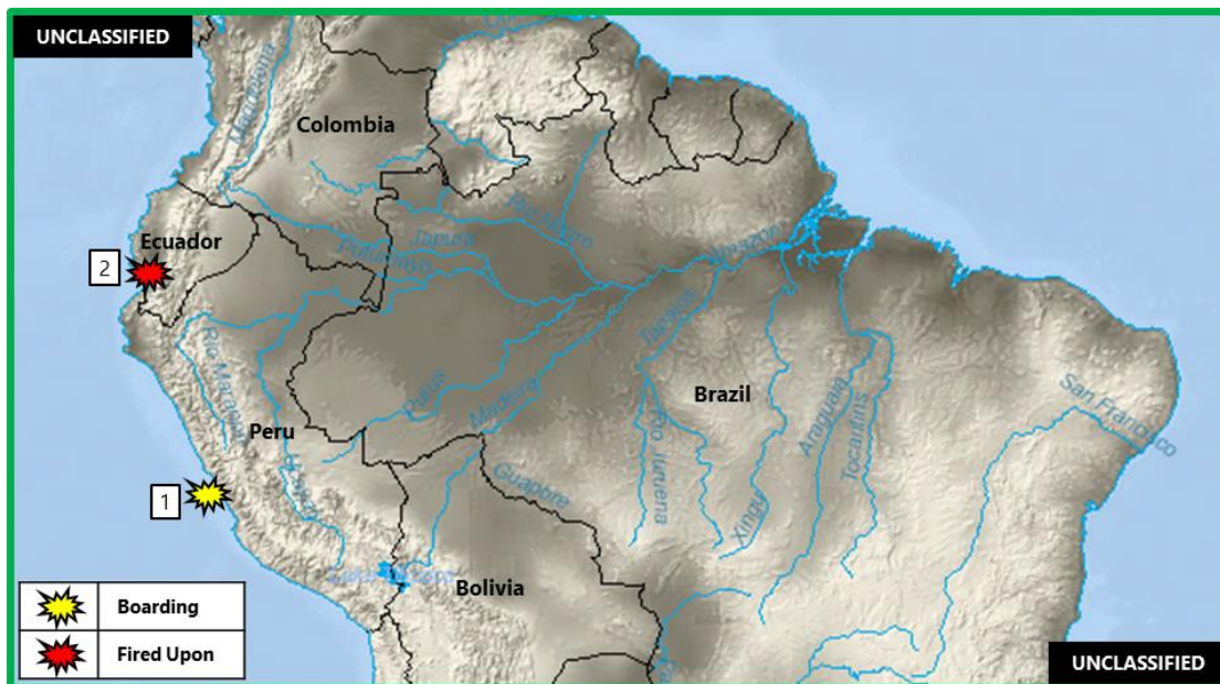
Figure 1. Central America – Caribbean – South America Piracy and Maritime Crime

B. (U) CENTRAL AMERICA – CARIBBEAN – SOUTH AMERICA: