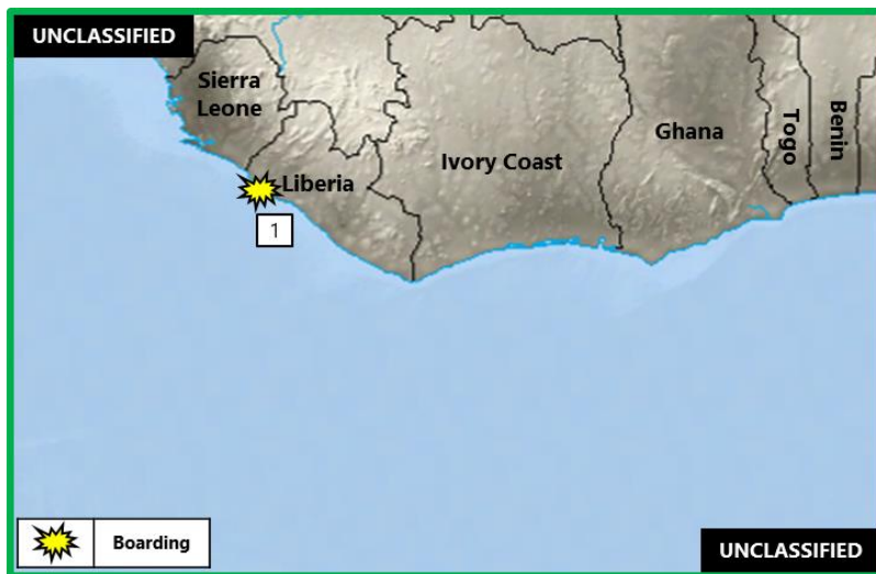
Figure 2. West Africa Piracy and Maritime Crime