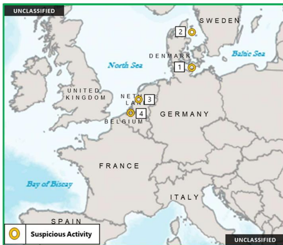
Figure 2. Northern Europe – Baltic Piracy and Maritime Crime

1. (U) GERMANY: On 23 March, a group of 20 protesters onboard rubber boats, and swimming in the water with lifejackets, swarmed the Malta-flagged tanker STAMOS while underway transiting from Ust-Luga, Russia, to Rotterdam, Netherlands, near position 54:33N – 011:12E. According to press reports, these environmental activists were protesting against oil imports from Russia. The group painted the hull of the STAMOS with “oil fuel wars” in large letters, demanding the suspension of oil transport from the Baltic Sea to western European ports. (Bietegheimer Zeitung; vesseltracker.com)