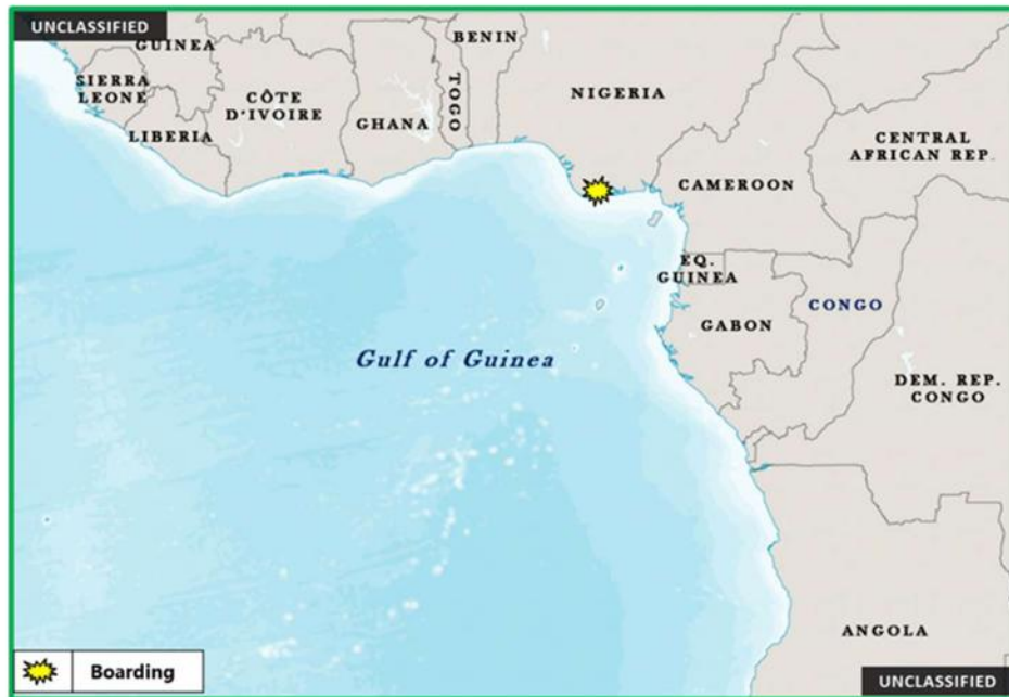
Figure 3. West Africa – Gulf of Guinea Piracy and Maritime Crime

1. (U) NIGERIA: On 19 March, at 0445 local time, robbers boarded a bulk carrier berthed in port of Lagos. The duty crew member discovered that the lock on the forecandle store was breached. The robbers escaped with an undetermined amount of paints. The investigation revealed that the robbers cut the anti-boarding razor wire on the vessel's waterside to board and escape the vessel. (MDAT-GoG; Clearwater Dynamics)