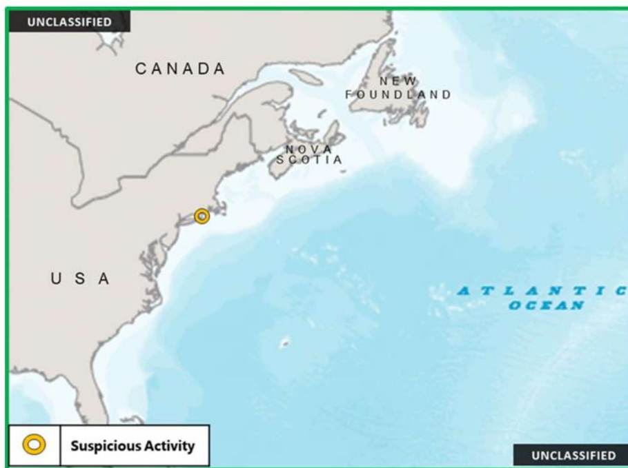
Figure 1. North America Piracy and Maritime Crime

1. (U) UNITED STATES OF AMERICA: On 20 March, a group of protesters onboard small boats circled two tankers, the Greece-flagged MINERVA VIRGO and the Liberia-flagged CONFIDENCE, on their way to the anchorage area of Ambrose Bay, New York. According to press reports, environmental activists were protesting against oil imports from Russia. (Maritime Executive; vesseltracker.com)