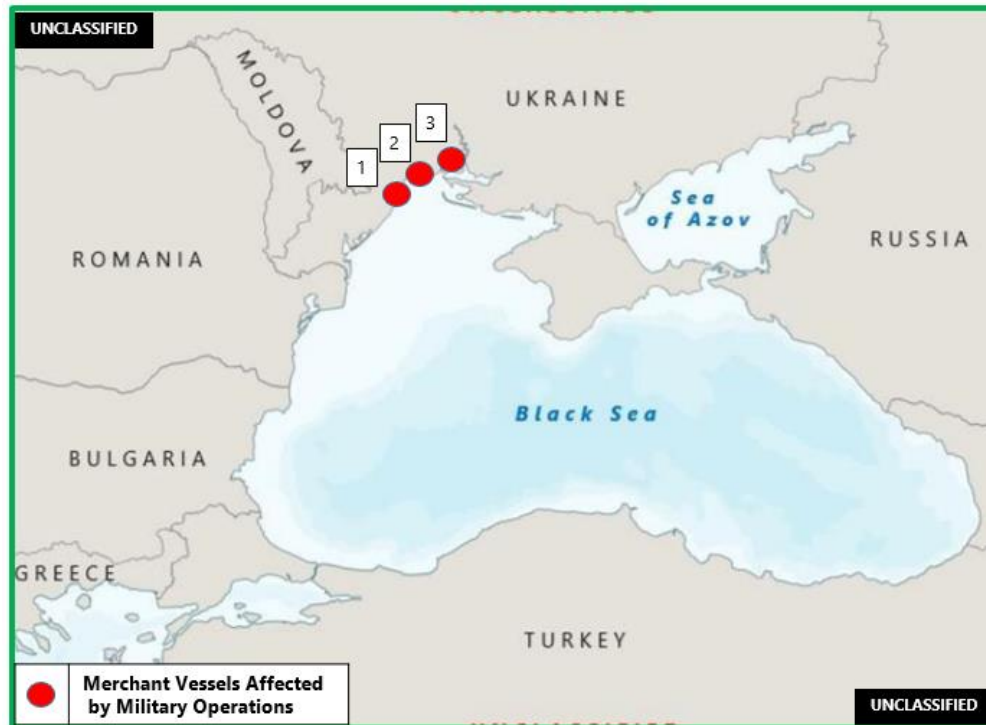
Figure 1. Mediterranean – Black Sea Piracy and Maritime Crime

1. (U) UKRAINE: Prior to 12 March, crew members of three bulk carriers (Marshall Islands-flagged RIVA WIND, Cayman Islands-flagged PUMA, and Liberia-flagged POLAR STAR), berthed at the port of Odessa, were evacuated. According to press reports, the crew members were transported to Hungary, where they were met by consular officers and ship's company representatives for repatriation. (Manila Bulletin; vesselfinder.com)