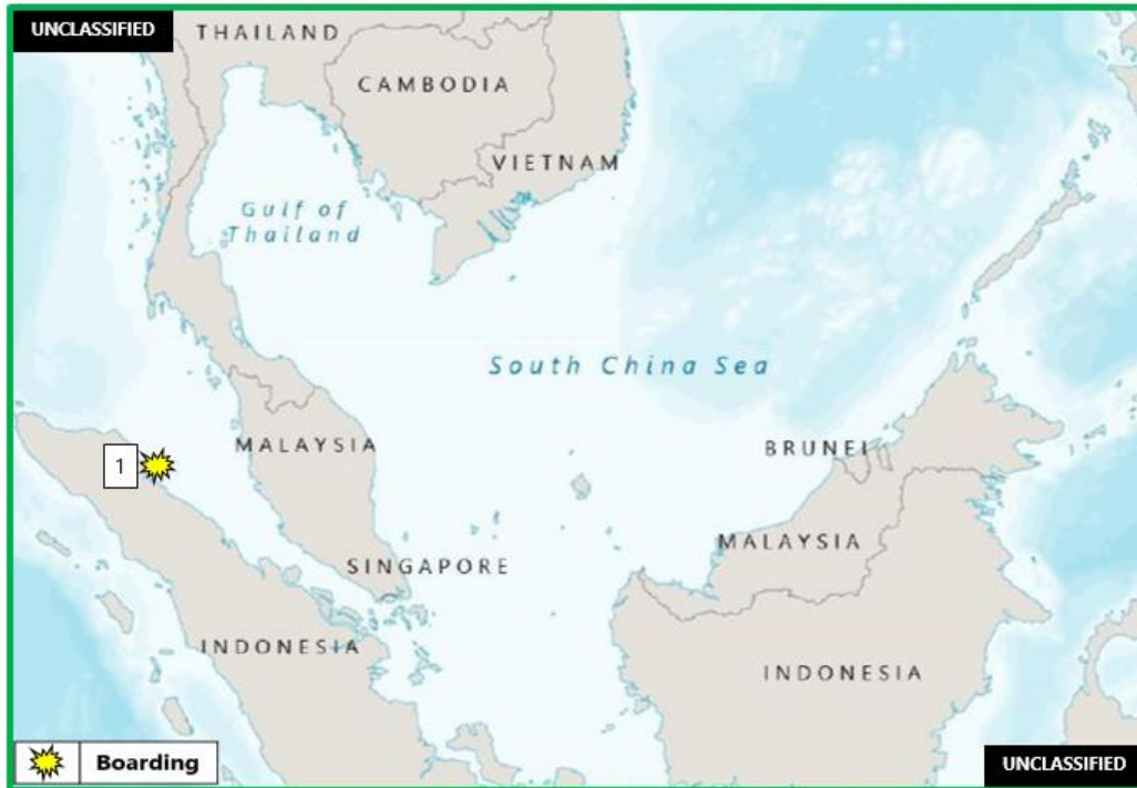
Figure 2. East Asia – Southeast Asia Piracy and Maritime Crime

1. (U) INDONESIA: On 25 March, at 0420 local time, three robbers armed with knives boarded the Singapore-flagged bulk carrier LAMPARD, anchored in Belawan Anchorage, near position 03:55N – 098:46E. The duty crew member first discovered the three robbers and raised the alarm, after which the crew mustered. After hearing the alarm, the perpetrators escaped with stolen ship's property. The incident was reported to the local authorities. (IMB; Clearwater Dynamics; vesseltracker.com)