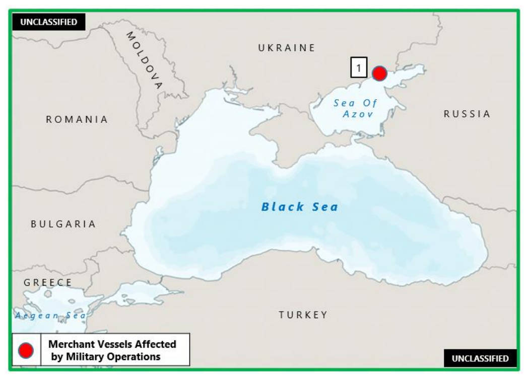
Figure 1. Mediterranean – Black Sea Piracy and Maritime Crime