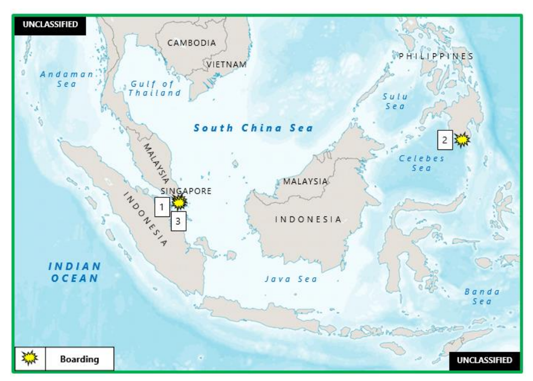
Figure 2. East Asia – Southeast Asia Piracy and Maritime Crime