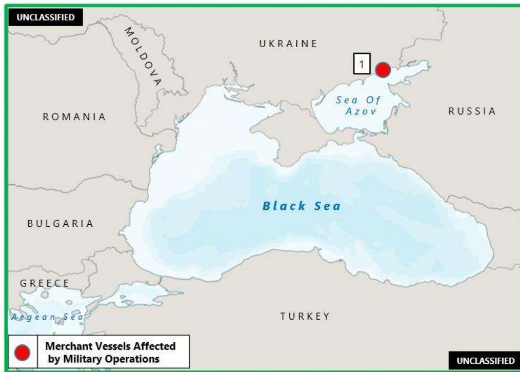
Figure 3. Mediterranean – Black Sea Piracy and Maritime Crime

1. (U) UKRAINE: Prior to 18 April, crew members were evacuated from the Malta-flagged bulk carrier TZAREVNA berthed at the port of Mariupol. According to press reports, the 15 seafarers (14 Bulgarian and one Ukrainian) traveled by bus from Mariupol to Sochi, Russia, where they were flown by a Bulgarian plane to Varna, Bulgaria. Bulgarian authorities reportedly facilitated the evacuation and coordinated with both Ukrainian and Russian authorities. Five remaining crew members opted to stay onboard the vessel. (Bulgarian News Agency; TASS; Balkan Insight)