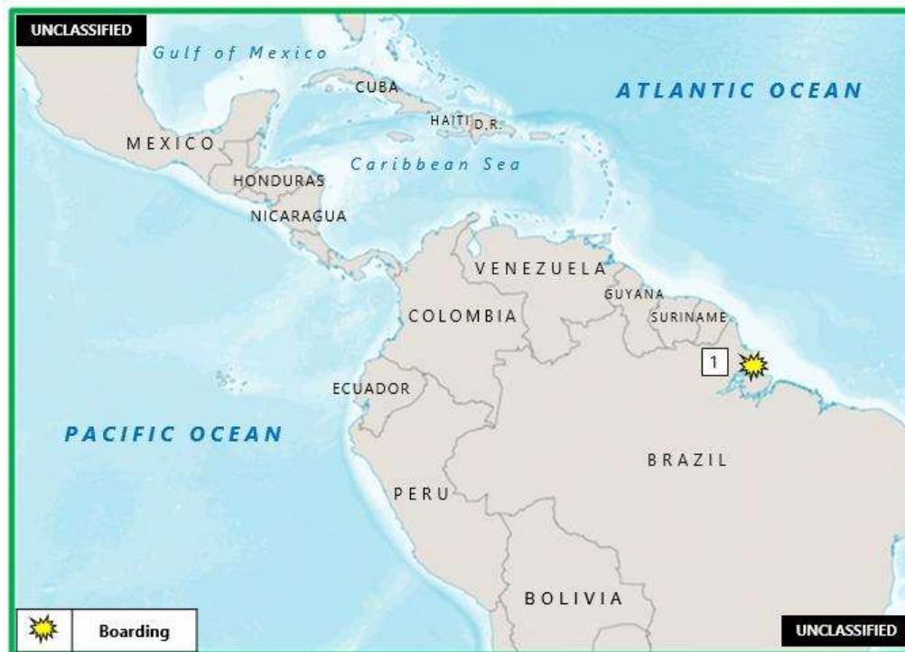
Figure 1. Central America – Caribbean – South America Piracy and Maritime Crime

B. (U) CENTRAL AMERICA – CARIBBEAN – SOUTH AMERICA: