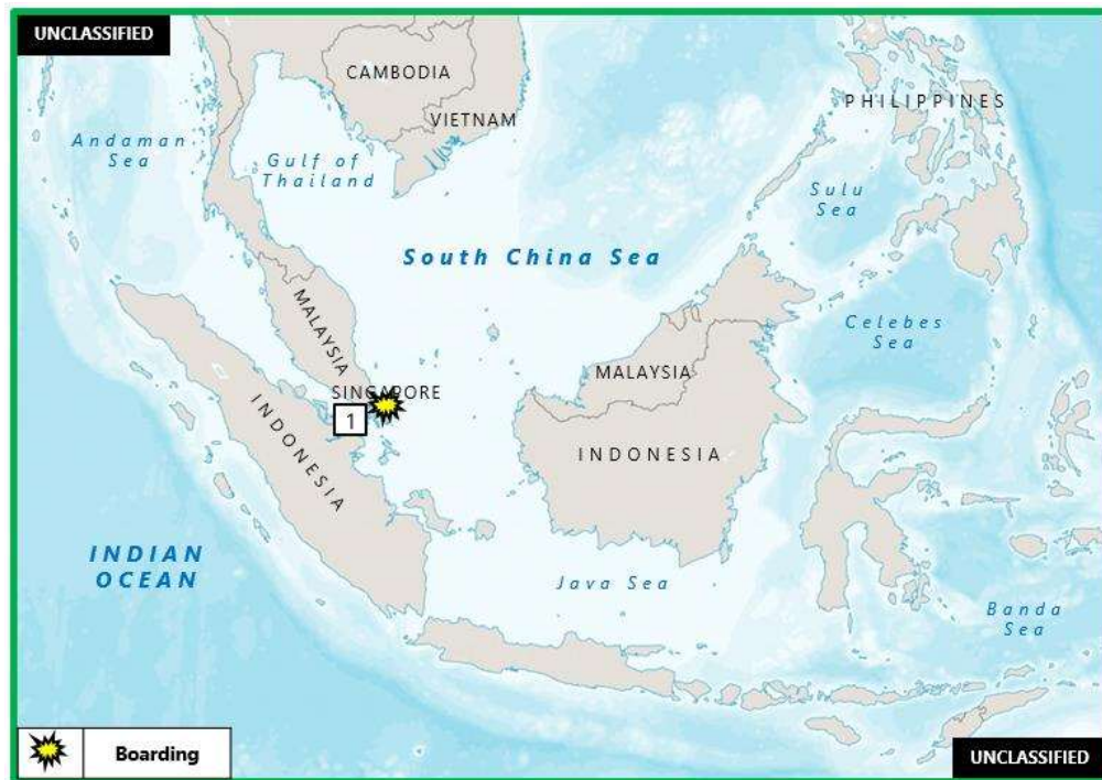
Figure 4. East Asia – Southeast Asia Piracy and Maritime Crime