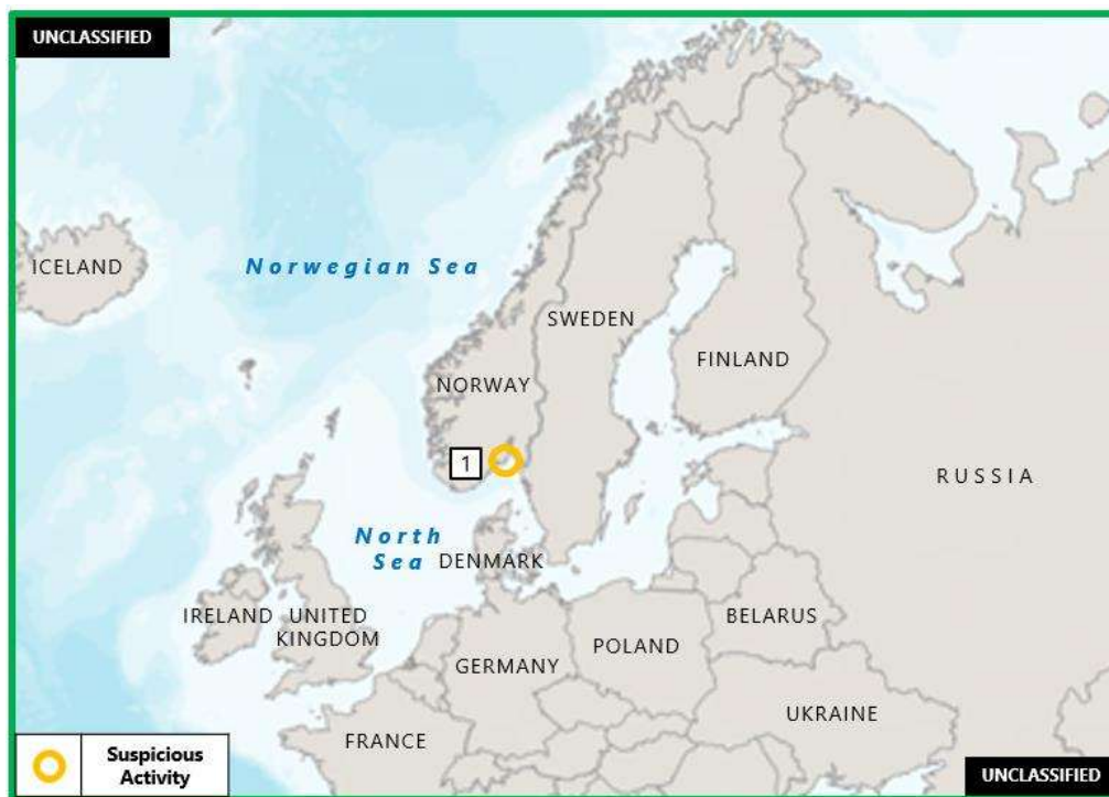
Figure 2. Northern Europe – Baltic Piracy and Maritime Crime

1. (U) NORWAY: On the morning of 25 April, a group of protesters onboard small boats and kayaks came alongside the Hong Kong-flagged tanker UST LUGA while anchored at Skagerrak, near position 59:19N – 010:30E. According to press reports, the group was protesting against oil imports from Russia. Activists onboard one of the small boats chained themselves to the ship's anchor chain to prevent the ship from raising its anchor, while others in kayaks unfurled banners reading "oil fuels war". The vessel was loaded with 95,000 tons of crude oil from the port of Ust-Luga, Russia. The local police and coast guard came to monitor the situation. Reports indicate that the vessel later berthed at the port of Slagen at 1800 local time the same day. (vesseltracker.com; Agence France-Presse; Times Malta)