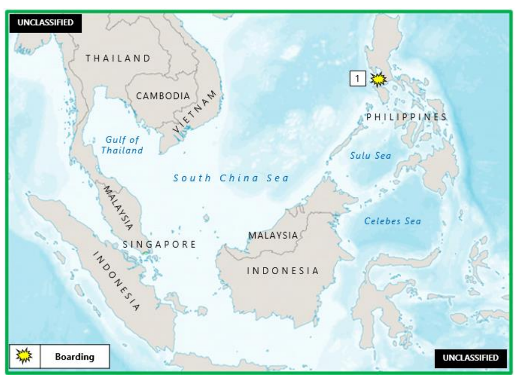
Figure 2. East Asia – Southeast Asia Piracy and Maritime Crime

1. (U) PHILIPPINES: On 28 April, at 0345 local time, three robbers boarded the Marshall Islands-flagged tanker SEXTANS anchored in Batangas Anchorage, near position 13:43N – 121:02E. The duty crew sighted the robbers in the forecastle deck. The alarm was raised, and the crew were mustered. The perpetrators escaped with stolen buckets of grease, a bundle of rope, and hatch butterfly nuts. The incident was reported to the local authorities. (ReCAAP; Clearwater Dynamics)