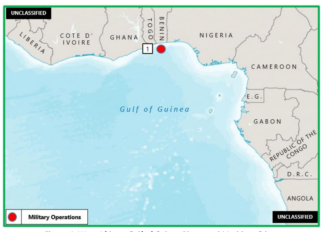
Figure 1. West Africa – Gulf of Guinea Piracy and Maritime Crime