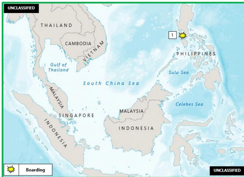
Figure 2. East Asia – Southeast Asia Piracy and Maritime Crime

1. (U) PHILIPPINES: On 28 April, at 0345 local time, three robbers boarded the Marshall Islands-flagged tanker SEXTANS anchored in Batangas Anchorage, near position 13:43N – 121:02E. The duty crew sighted the robbers in the forecandle deck. The alarm was raised, and the crew were mustered. The perpetrators escaped with stolen buckets of grease, a bundle of rope, and hatch butterfly nuts. The incident was reported to the local authorities. (ReCAAP; Clearwater Dynamics)