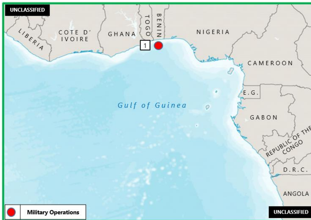
Figure 1. West Africa – Gulf of Guinea Piracy and Maritime Crime