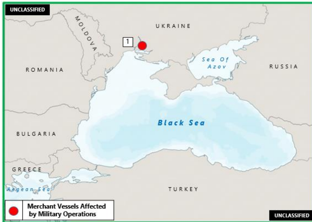
Figure 1. Mediterranean - Black Sea Piracy and Maritime Crime

1. (U) UKRAINE: On 3 May, the Singapore-flagged tanker MTM RIO GRANDE was struck by a shell while berthed at the port of Nika-Tera, Mykolayiv. According to press reports, the vessel was indirectly hit during Russian shelling of the port. The vessel has been in the port, where it was scheduled to load sunflower oil, since 24 February; the ship has been unable to load cargo or leave as a result of the war in Ukraine. According to earlier press reports, the vessel's crew were evacuated prior to 12 March. (vesseltracker.com; Ukrainian Shipping Magazine)