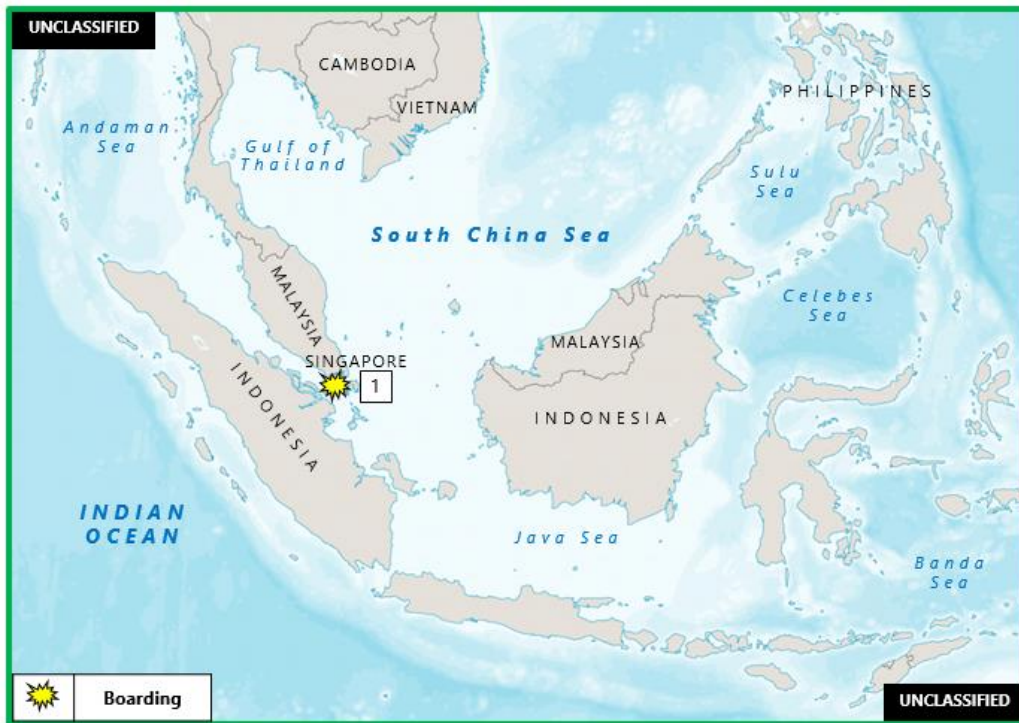
Figure 4. East Asia –Southeast Asia - Piracy and Maritime Crime

1. (U) INDONESIA: On 12 May, at 0118 local time, three robbers boarded an underway tanker in the eastbound lane of the Singapore Strait Traffic Separation Scheme (TSS), near position 01:10N – 103:25E. The robbers escaped after being discovered in the ship's engine room. It was reported that nothing was stolen, all crew were safe, and the vessel continued her voyage. (Clearwater Dynamics)