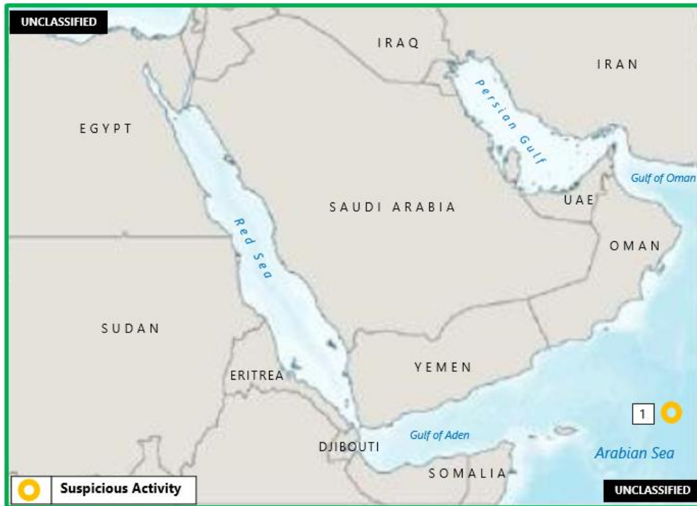
Figure 3. Indian Ocean – East Africa – Red Sea Piracy and Maritime Crime

H. (U) INDIAN OCEAN – EAST AFRICA – RED SEA: