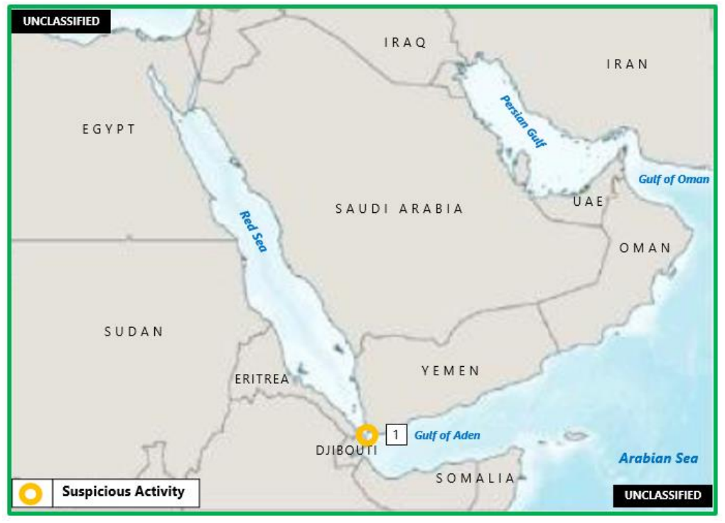
Figure 3. Indian Ocean - East Africa - Red Sea Piracy and Maritime Crime

1. (U) DJIBOUTI: On 25 May, at 1050 local time, an underway survey vessel reported a suspicious approach by a skiff with eight people onboard approximately 5 NM southeast of Perim Island, near position 12:33N – 043:31E. Upon sighting of the skiff, the master raised the alarm, anti-piracy measures were implemented, and the security team onboard positioned on the bridge. The skiff came close to within half a nautical mile before aborting the approach. The master reported the incident to the authorities. (Clearwater Dynamics)