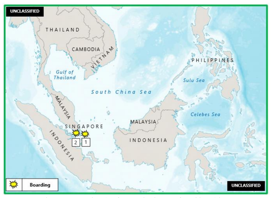
Figure 4. East Asia – Southeast Asia Piracy and Maritime Crime

1. (U) INDONESIA: On 21 May, at 0500 local time, four robbers armed with machetes boarded the Barbados-flagged bulk carrier SELENA underway 15 NM east of Mapur Island, near position 01:02N – 105:05E. The perpetrators forced their entry into the navigational bridge through the bridge wing door. They threatened the duty officer and demanded to be brought to the master's cabin. The perpetrators tried to gain access to the master's cabin but failed. The alarm was raised and off duty crew were ordered through the public address system to lock themselves in their cabins. The crew mustered later and the vessel was searched. There were no sightings