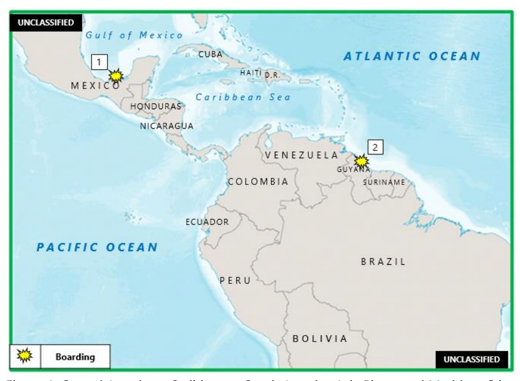
Figure 1. Central America – Caribbean – South America Asia Piracy and Maritime Crime