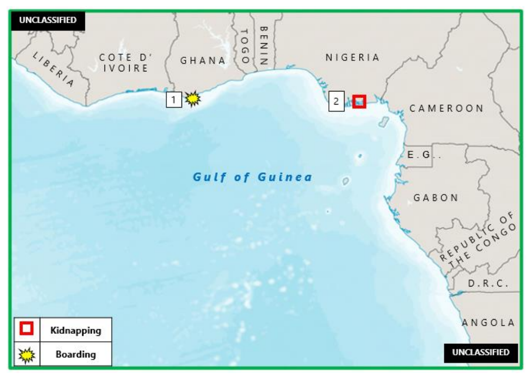
Figure 2. West Africa – Gulf of Guinea Piracy and Maritime Crime