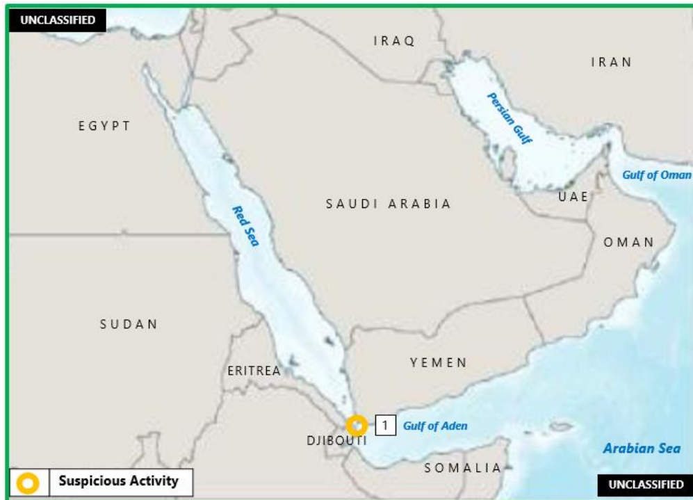
Figure 3. Indian Ocean - East Africa – Red Sea Piracy and Maritime Crime

H. (U) INDIAN OCEAN – EAST AFRICA – RED SEA: