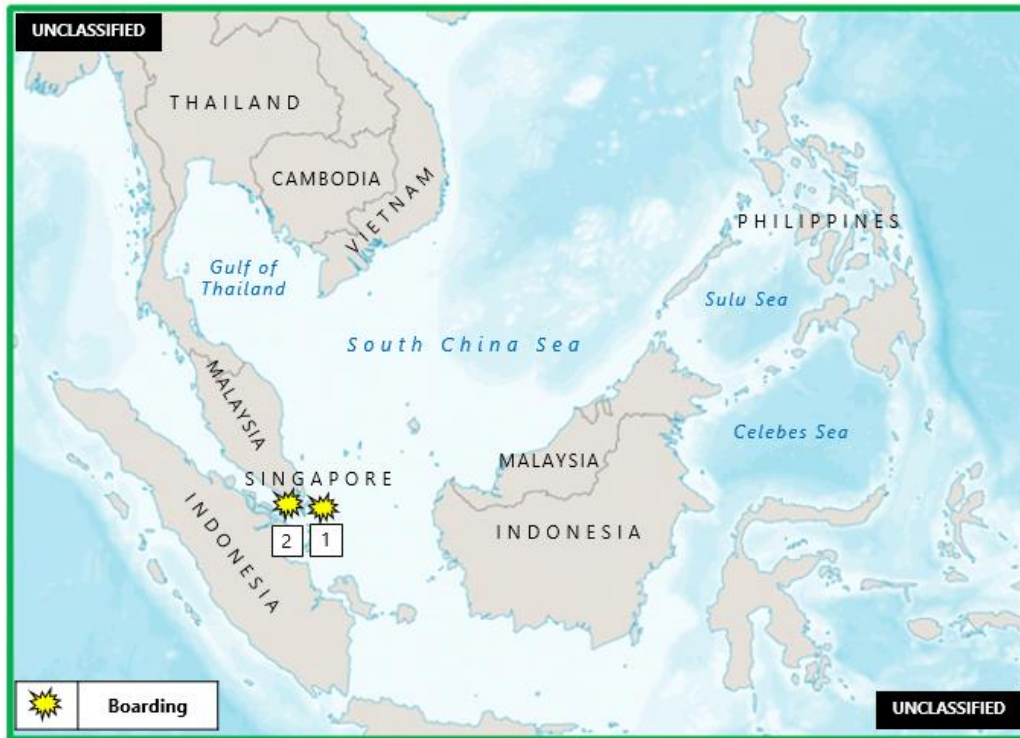
Figure 4. East Asia – Southeast Asia Piracy and Maritime Crime

1. (U) INDONESIA: On 21 May, at 0500 local time, four robbers armed with machetes boarded the Barbados-flagged bulk carrier SELENA underway 15 NM east of Mapur Island, near position 01:02N – 105:05E. The perpetrators forced their entry into the navigational bridge through the bridge wing door. They threatened the duty officer and demanded to be brought to the master's cabin. The perpetrators tried to gain access to the master's cabin but failed. The alarm was raised and off duty crew were ordered through the public address system to lock themselves in their cabins. The crew mustered later and the vessel was searched. There were no sightings