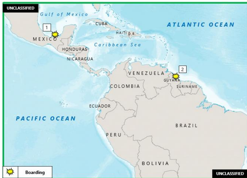
Figure 1. Central America – Caribbean – South America Asia Piracy and Maritime Crime

B. (U) CENTRAL AMERICA – CARIBBEAN – SOUTH AMERICA: