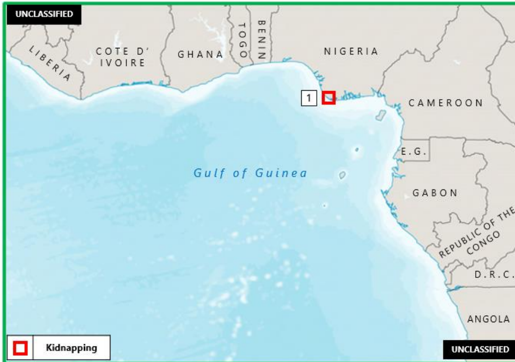
Figure 1. West Africa – Gulf of Guinea Piracy and Maritime Crime

1. (U) NIGERIA: On 14 June, an unknown number of pirates intercepted and boarded a passenger boat with 15 persons onboard while traveling along waterways in the Brass Local Government Area of Bayelsa State, near position 04:27N – 006:21E. Eight passengers were reported kidnapped while six passengers and the boat's skipper were left near the site of the incident, and were later rescued by the Marine Police. (mangrovepen.ng; Clearwater Dynamics)