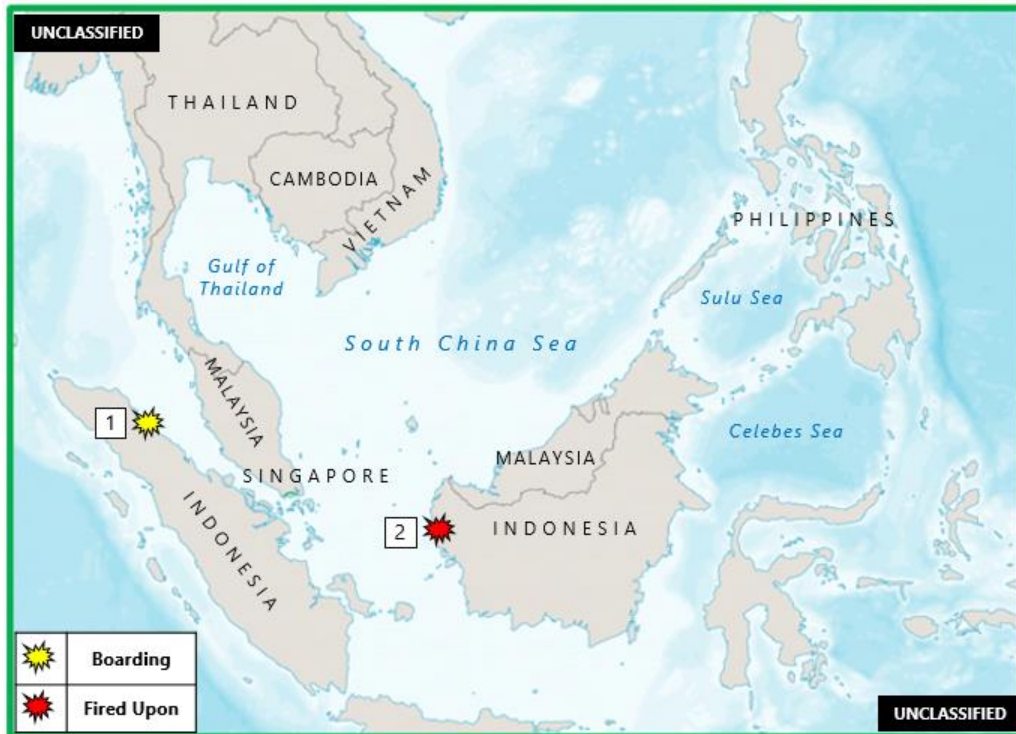
Figure 2. East Asia – Southeast Asia Piracy and Maritime Crime

1. (U) INDONESIA: On 13 June, at 0330 local time, a robber boarded the Marshall Islands-flagged chemical tanker SILVER EBURNA anchored in Belawan Anchorage, near position 03:56N – 098:44E. The duty officer sighted the robber at the ship's forecandle area, the alarm was raised, and the crew mustered, which resulted in the perpetrator escaping empty-handed. The incident was reported to the local authorities. (vesseltracker.com; Clearwater Dynamics)