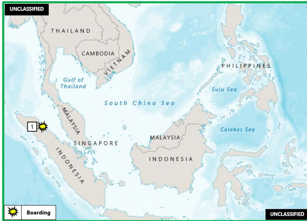
Figure 2. East Asia – Southeast Asia Piracy and Maritime Crime

1. (U) INDONESIA: On 29 June, at 0230 local time, two robbers boarded the Singapore-flagged tanker MAERSK BERING while berthed in Port Belawan. A duty crew member sighted the two robbers leaving the vessel in an open boat. The vessel was searched, and it was discovered that fire hydrant caps, hydrant couplings, and fire hose nozzles were stolen from the ship's stores. All crew members were reported safe and the incident was reported to the local authorities. (ReCAAP; Clearwater Dynamics)