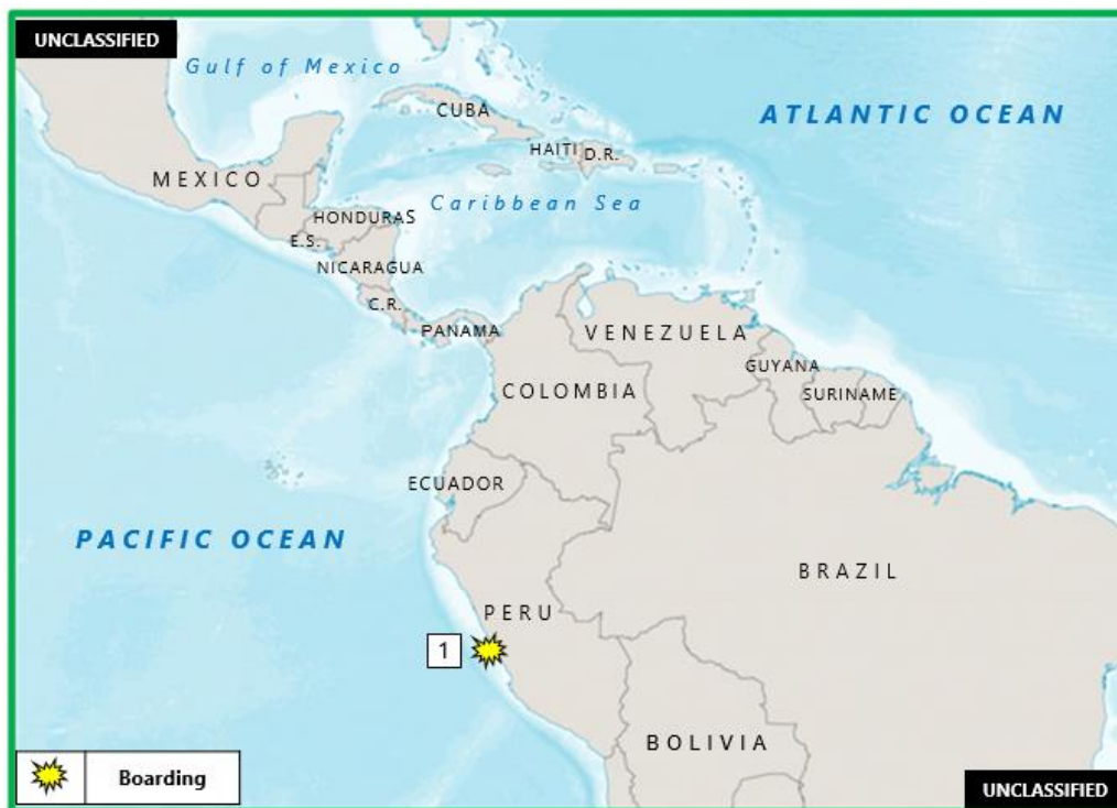
Figure 1. Central America –Caribbean – South America Piracy and Maritime Crime

1. (U) PERU: On 23 June, at 0245 local time, three robbers armed with long knives boarded the Marshall Islands-flagged tanker EVERBRIGHT anchored in Callao Anchorage, near position 12:01S – 077:13W. The alarm was raised, and upon hearing the alarm, the robbers escaped with stolen ship's stores. The incident was reported to the local authorities. (vesseltracker.com; IMB; Clearwater Dynamics)