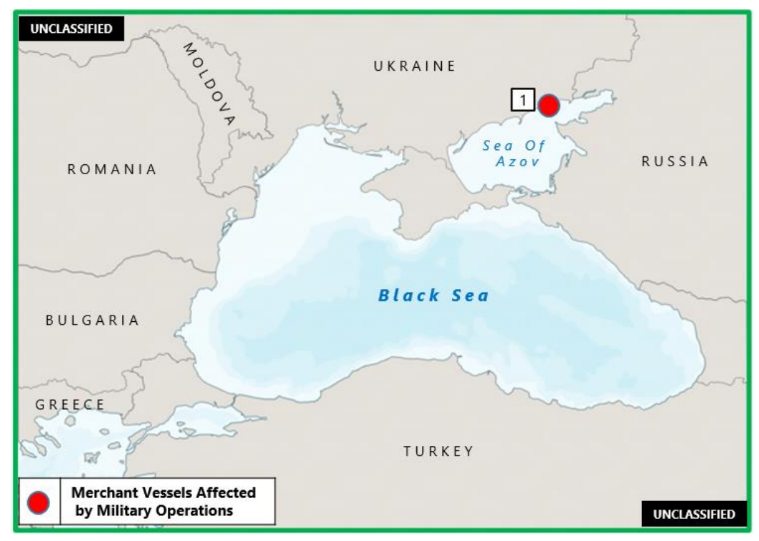
Figure 1. Mediterranean – Black Sea Piracy and Maritime Crime

1. (U) UKRAINE: Prior to 5 July, two bulk carriers, Liberia-flagged SMARTA and Panama-flagged BLUE STAR I, that had already berthed at the port of Mariupol, were seized by the Russian-backed separatist group, Donetsk Peoples Republic (DPR). According to press reports, DPR representatives sent letters to the two shipping companies stating that their ships were subjected to "forcible appropriation of movable property with forced conversion into state property," offering no compensation. The two ships have been stranded at the port since 24 February 2022 and their crews were reportedly evacuated on or before 11 April 2022. (Clearwater Dynamics; gCaptain; Reuters; Newsweek; Maritime Executive)