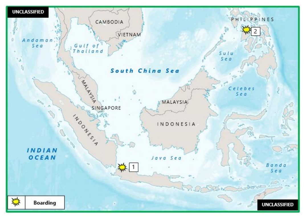
Figure 3. East Asia – Southeast Asia Piracy and Maritime Crime