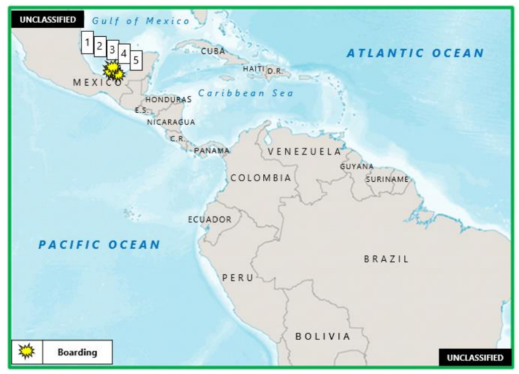
Figure 1. North America Piracy and Maritime Crime