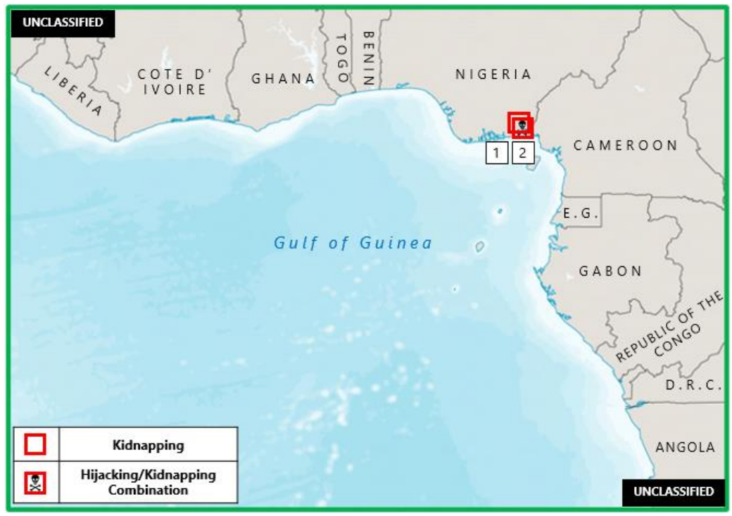
Figure 2. West Africa – Gulf of Guinea Piracy and Maritime Crime