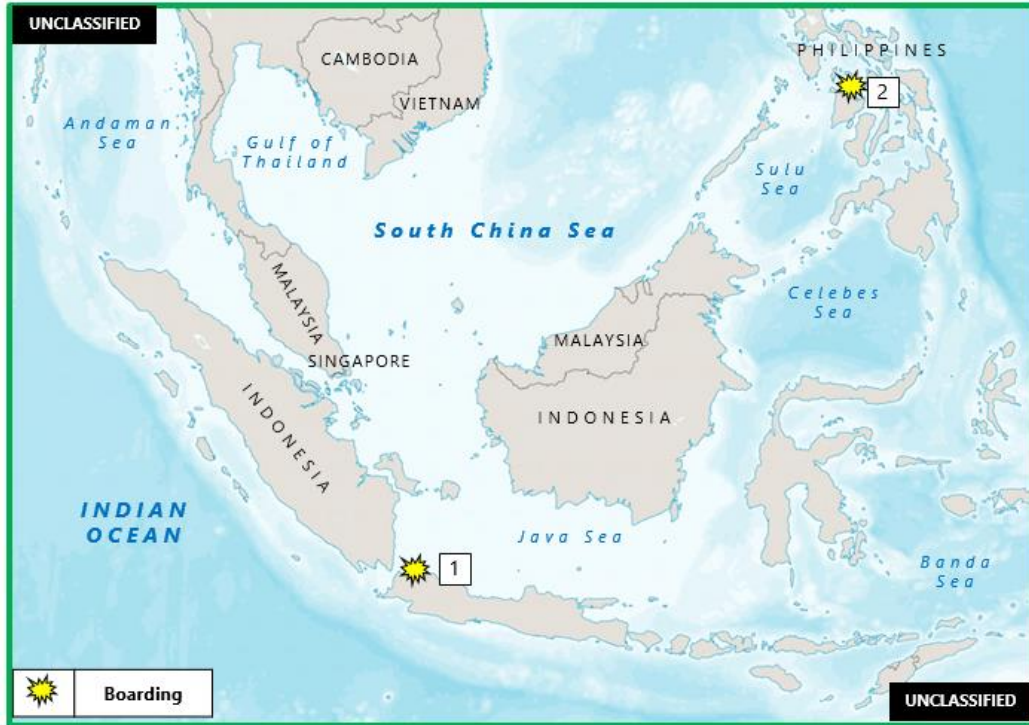
Figure 3. East Asia – Southeast Asia Piracy and Maritime Crime

1. (U) INDONESIA: On 18 July, at 0100 local time, three robbers armed with long knives attempted to board a bulk carrier as it approached the Jakarta Anchorage area, near position 06:20S – 106:54E. A duty crew member spotted the robbers and immediately informed the bridge. The alarm was raised, and the perpetrators escaped empty-handed. All crew were reported safe and the incident was reported to the local authorities. (IMB; Clearwater Dynamics)