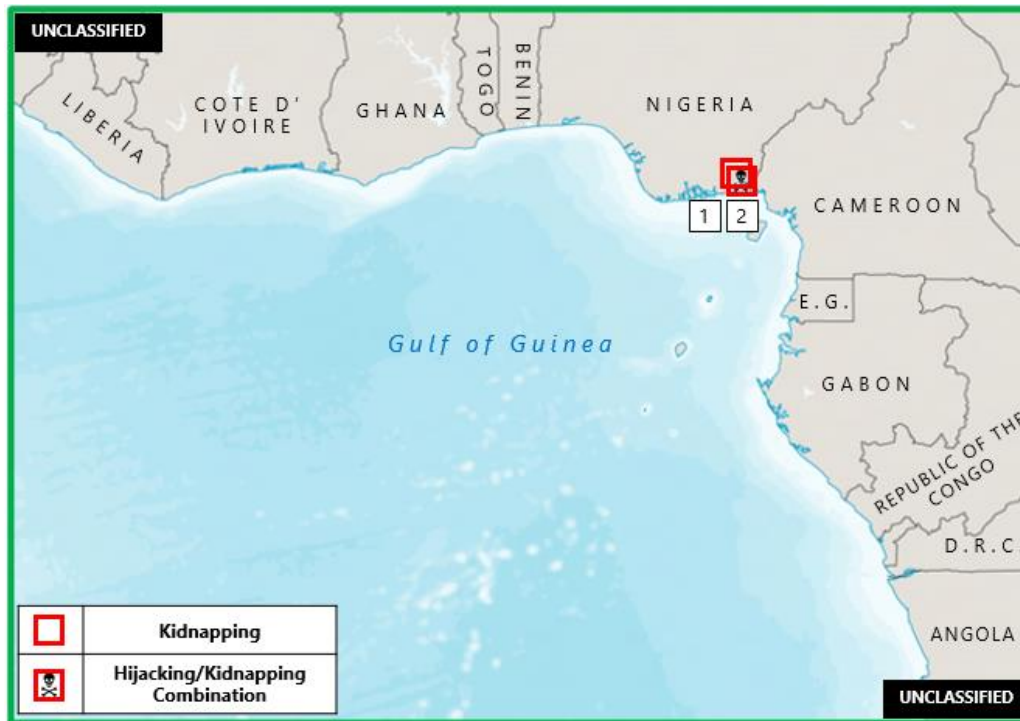
Figure 2. West Africa – Gulf of Guinea Piracy and Maritime Crime

1. (U) NIGERIA: On 16 July, pirates intercepted and boarded an underway passenger boat with an unknown number of people onboard while in transit on inland waterways from Calabar in Cross River State to Oron Beach in Akwa Ibom State, near position 04:55N – 008:17E. According to press reports, the perpetrators stole passengers' belongings and kidnapped all male passengers, including the boat captain. The female passengers were left in the passenger boat. One of the passengers contacted the authorities, and the Nigerian Navy and Marine Police responded and chased the pirates. The pirates escaped, and released all but two of the kidnapped male passengers. The released passengers were rescued by the Marine Police. (Clearwater Dynamics; Vanguard; Sahara Reporter)