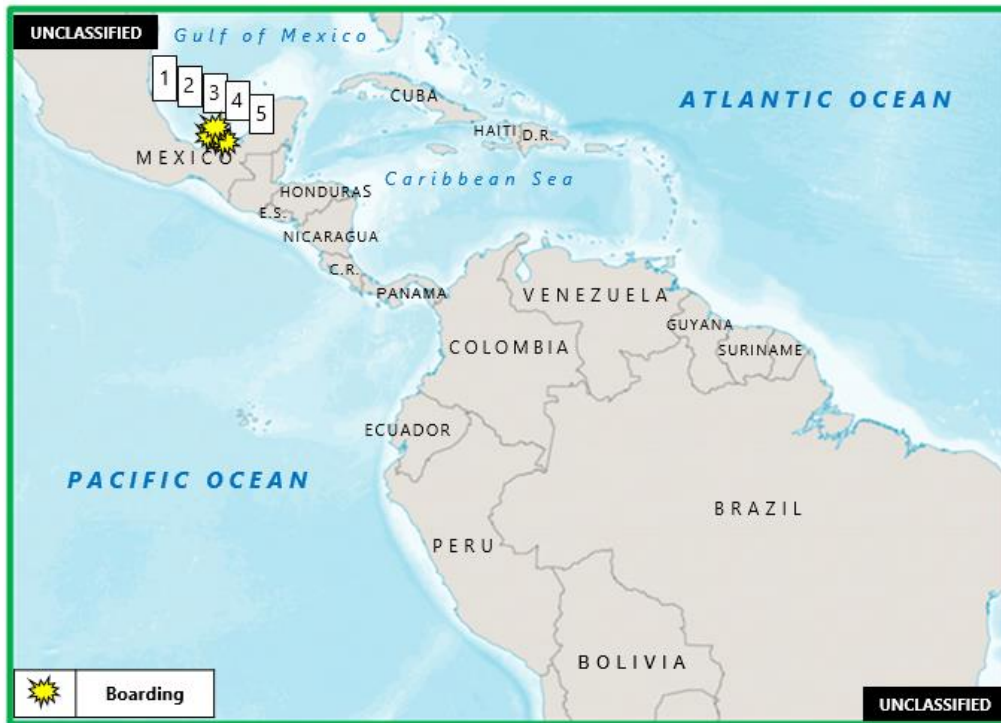
Figure 1. North America Piracy and Maritime Crime

1. (U) MEXICO: On 17 July, at about dawn, an unknown number of robbers boarded the Petroleos Mexicanos (PEMEX) satellite platform KUIL-B located in the Kuil field, Abkatun-Pol-Chuc in the Bay of Campeche, approximately 71 NM northeast of Puerto Dos Bocas. According to press reports, the perpetrators stole sets of self-contained breathing apparatus equipment, tools, pump, lamps, and cables. (vesseltracker.com; Poresto)