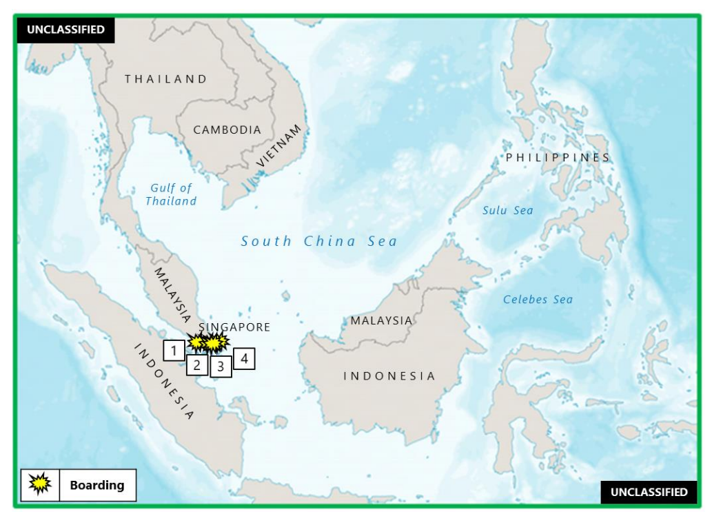
Figure 1. East Asia – Southeast Asia Piracy and Maritime Crime