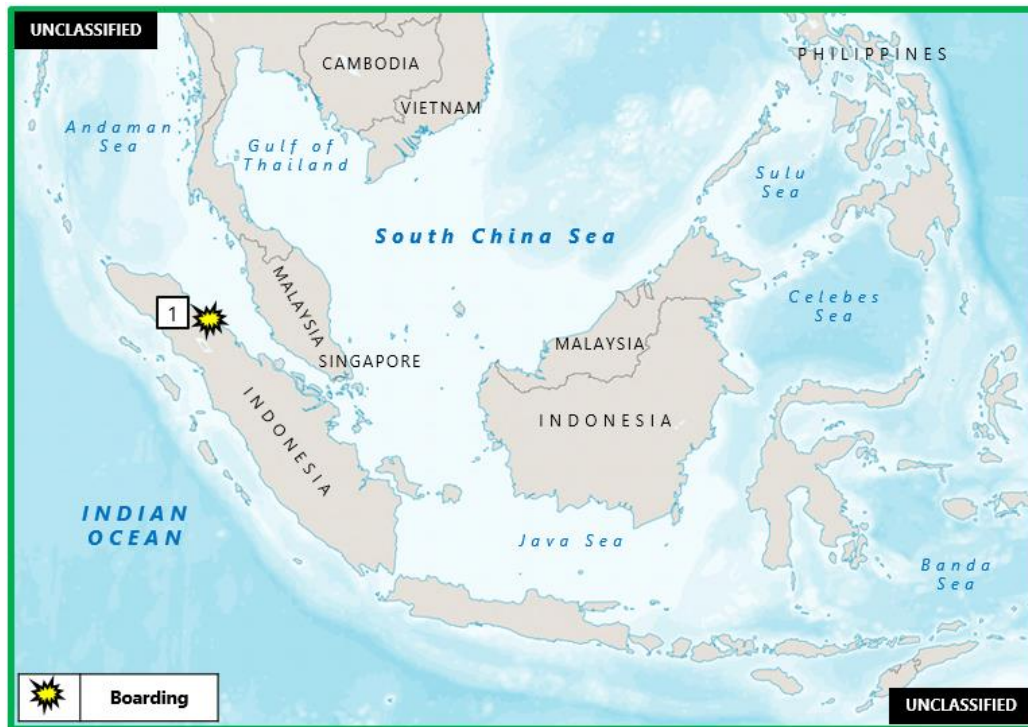
Figure 3. East Asia – Southeast Asia Piracy and Armed Robbery at Sea

1. (U) INDONESIA: On 18 August, at 0445 local time, two robbers armed with knives boarded the Panama-flagged bulk carrier NORD AQUARIUS anchored at Belawan Anchorage, near position 03:56N – 098.47E. The duty crew noticed the perpetrators near the forecandle store and immediately notified the duty officer. The alarm was raised, a PA announcement was made, and the crew mustered. Upon hearing the alarm, the robbers escaped with stolen ship's properties. The incident was reported to the local authorities. (Clearwater Dynamics; IMB; vesseltracker.com)