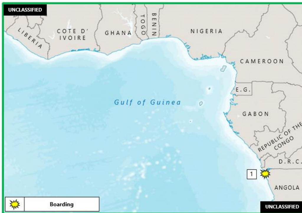
Figure 2. West Africa – Gulf of Guinea Piracy and Armed Robbery at Sea

1. (U) ANGOLA: On 24 August, at 0420 local time, a robbery occurred on a container ship anchored approximately 7.7 NM west of Soyo, near position 06:07S – 012:12E. Two robbers boarded the ship and escaped with stolen boxes of refrigerated chickens. The incident was reported to the local authorities. (Clearwater Dynamics; MDAT-GoG)