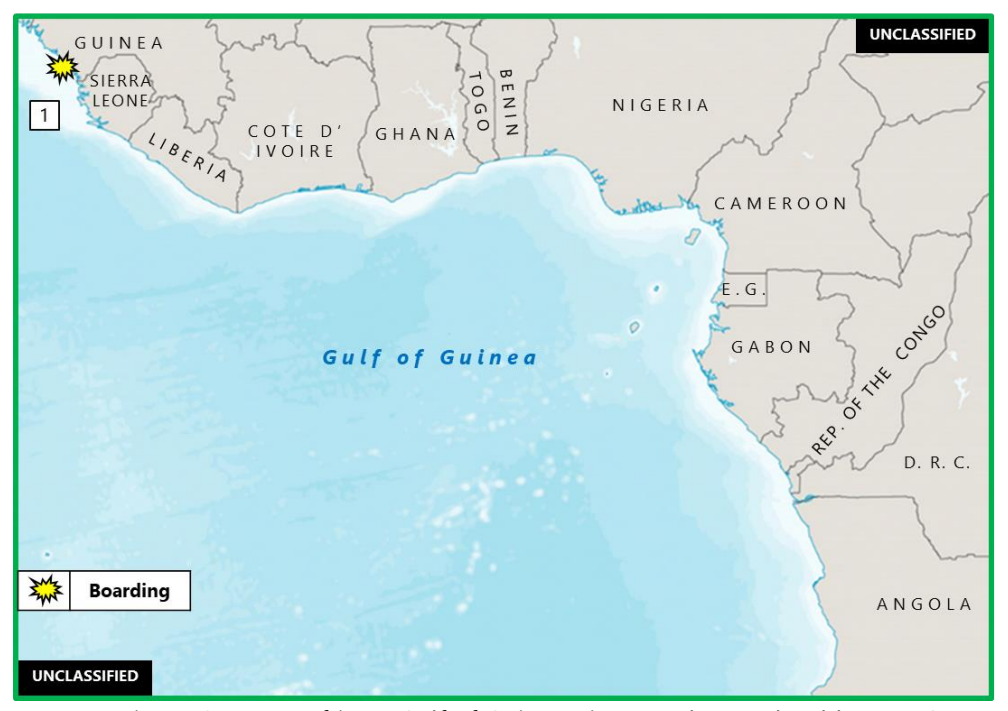
(U) Figure 2. West Africa – Gulf of Guinea Piracy and Armed Robbery at Sea