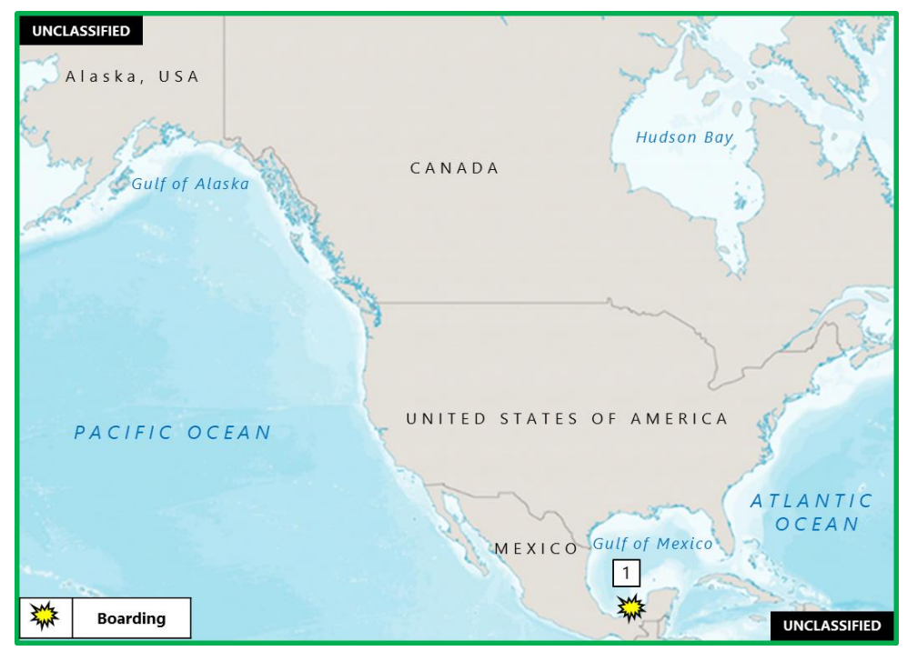
(U) Figure 1. North America Piracy and Armed Robbery at Sea