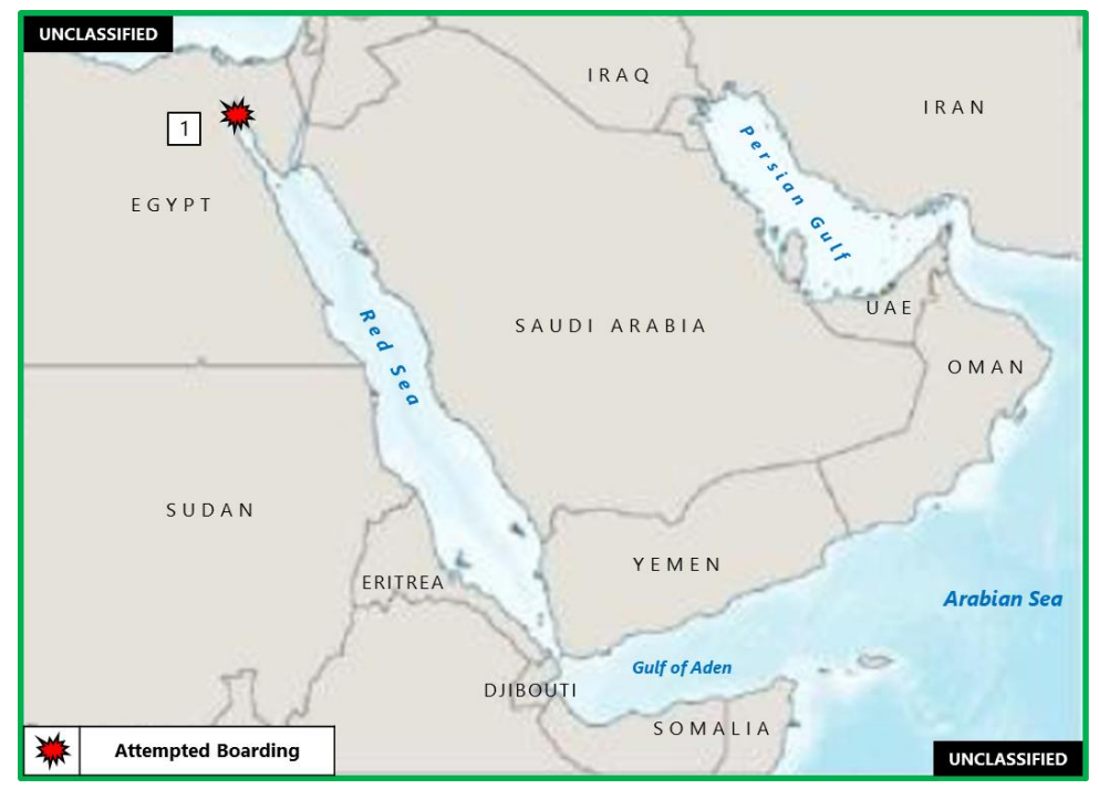
(U) Figure 3. Indian Ocean – East Africa – Red Sea Piracy and Armed Robbery at Sea

1. (U) EGYPT: On 7 September at 0415 local time, the duty crew of the anchored United States of America-flagged container ship MAERSK COLUMBUS noticed two perpetrators attempting to board via the anchor chain in position 29:49N – 032:34E at the Southern Anchorage of the Suez Canal. The duty crew directed a searchlight towards them, which resulted in the perpetrators escaping empty-handed. (IMB; vesseltracker.com; Clearwater Dynamics)