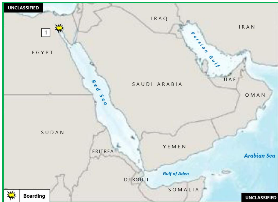
(U) Figure 1. Indian Ocean – East Africa – Red Sea Piracy and Armed Robbery at Sea

H. (U) INDIAN OCEAN – EAST AFRICA – RED SEA: