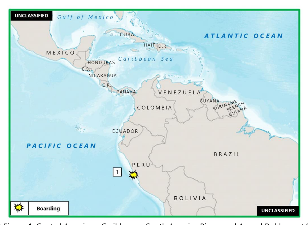
(U) Figure 1. Central America – Caribbean – South America Piracy and Armed Robbery at Sea

1. (U) PERU: On 29 September at 0015 local time, robbers boarded a berthed tanker near position 12:02N – 077:08W at Callao Port. The perpetrators stole ship's stores and escaped unnoticed. During routine rounds, the duty crew discovered evidence of a robbery. The vessel notified local authorities and port control of the incident. (IMB; Clearwater Dynamics)