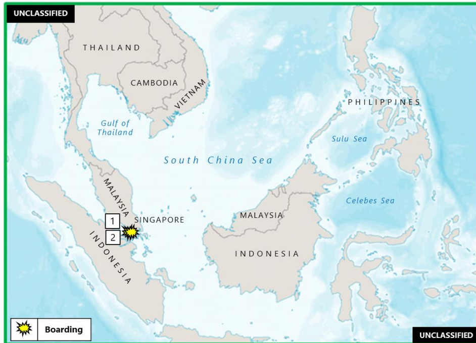
(U) Figure 3. East Asia – Southeast Asia Piracy and Armed Robbery at Sea

1. (U) INDONESIA: On 14 December at 0400 local time, three robbers boarded Marshall Islands-flagged bulk carrier GOLDEN HOUSTON underway in the eastbound lane of the Singapore Strait Traffic Separation Scheme (TSS), near position 01:03N – 103:38E. The perpetrators stole a portable phone and generator parts before escaping. The master reported the incident to the Port Operations Control Centre (POCC). The crew were reported safe, and the vessel continued its voyage to Singapore. (Clearwater Dynamics; vesseltracker.com)