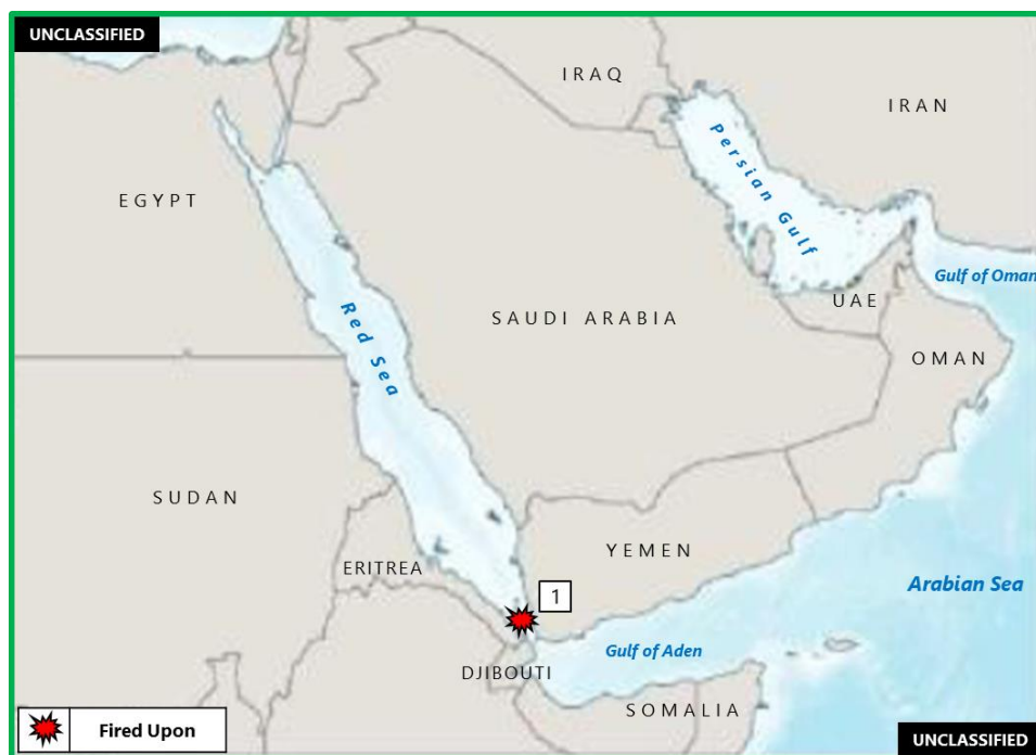
(U) Figure 2. Indian Ocean – East Africa – Red Sea Piracy and Armed Robbery at Sea

H. (U) INDIAN OCEAN – EAST AFRICA – RED SEA: