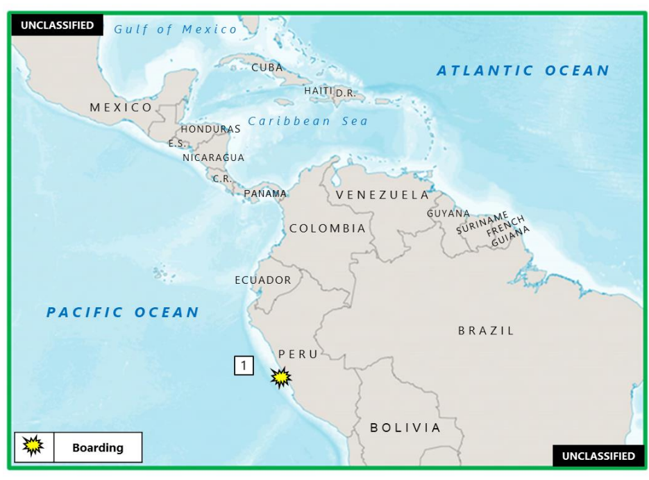
(U) Figure 2. Central America – Caribbean – South America Piracy and Armed Robbery at Sea