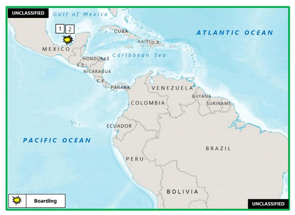
(U) Figure 1. North America Piracy and Armed Robbery at Sea