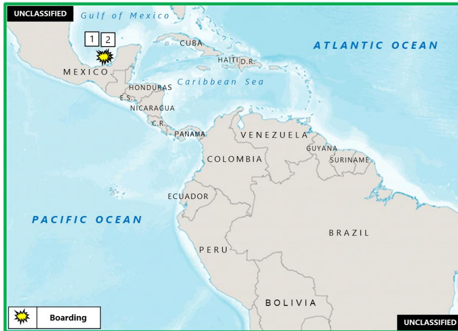
(U) Figure 1. North America Piracy and Armed Robbery at Sea

incidents are not double-counted. In the event that double-counting is detected, or an incident is later found to be different than initially reported, an explanation of the cancellation of the inaccurate report will be made in at least one message prior to dropping the erroneous report.