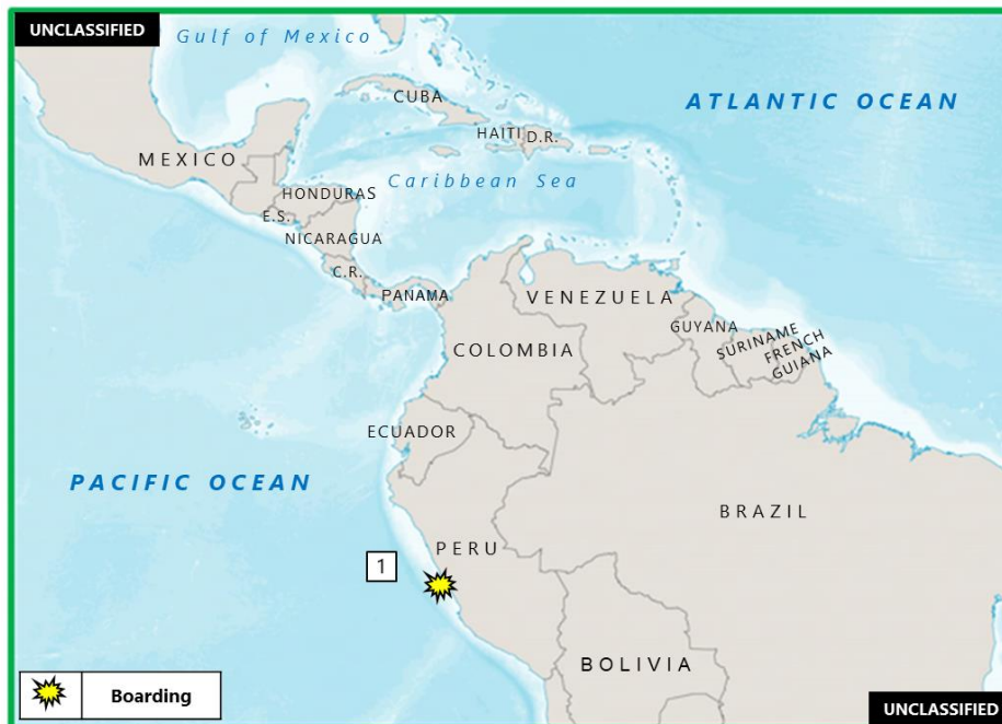
(U) Figure 2. Central America – Caribbean – South America Piracy and Armed Robbery at Sea

1. (U) PERU: On 20 December at 0245 local time, five robbers armed with knives boarded a product tanker anchored in Callao Anchorage, near position 12:00S – 077:12W. The perpetrators gained access to the vessel via the anchor chain. Once onboard, they threatened a duty crewmember with a knife and tied him up. The robbers then broke into the forecandle store, stole ship's property, and escaped. After freeing himself, the duty crewmember alerted the bridge. The alarm was raised and the crew mustered. The incident was reported to Callao Vessel Traffic Service (VTS). (Clearwater Dynamics; IMB)