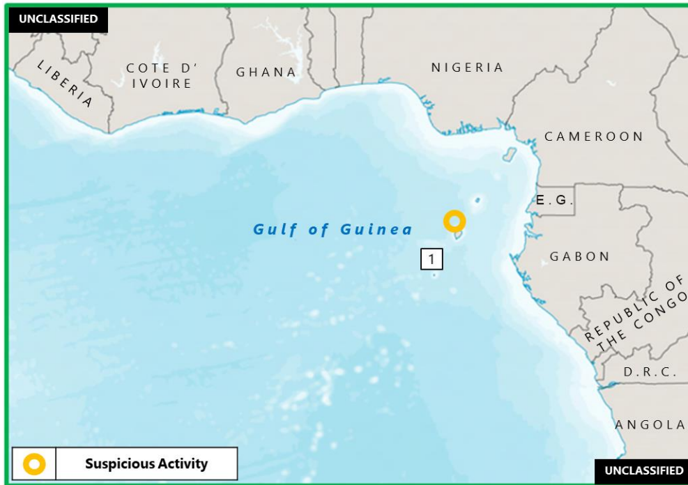
Figure 2. (U) West Africa – Gulf of Guinea Piracy and Armed Robbery at Sea

1. (U) SAO TOME AND PRINCIPE: On 11 January at 0200 local time, two skiffs made a suspicious approach to an unidentified vessel located approximately 27 NM northwest of Sao Tome Island near position 00:45N – 006:20E. The master took evasive action and increased the vessel's speed causing the skiffs to abandon their approach. The crew and vessel are reported safe. (IMB; Clearwater Dynamics)